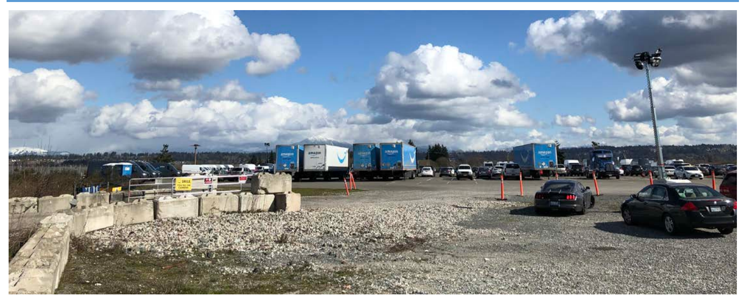
Cleanup site facing east, March 2020