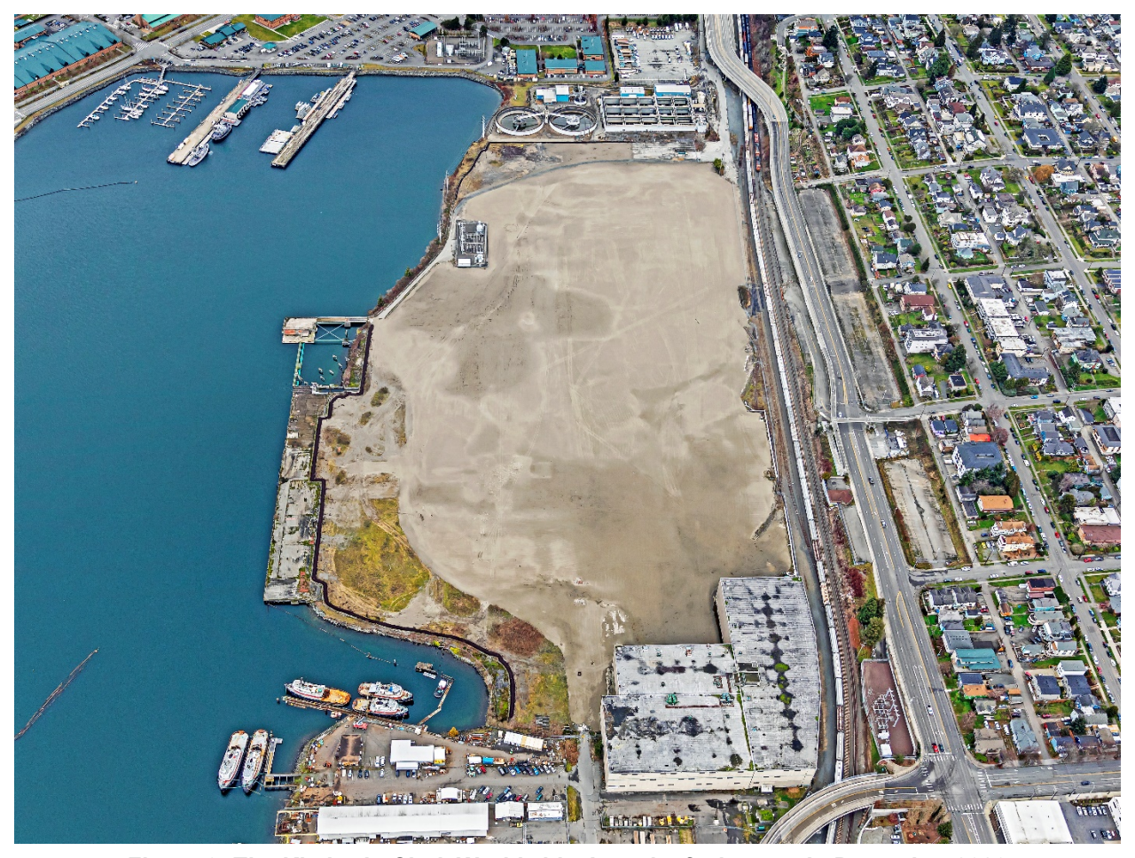
Figure 3: The Kimberly-Clark Worldwide, Inc. site facing north, December 2020