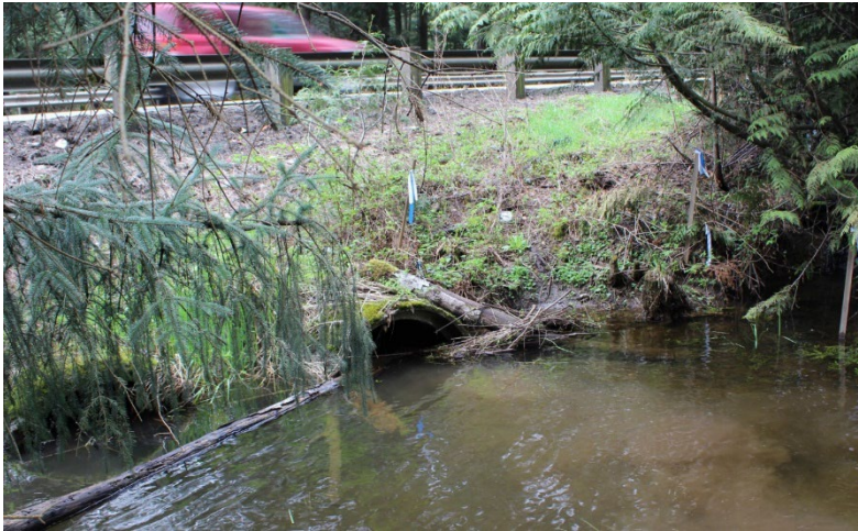
Figure 2: Lake Creek Culvert