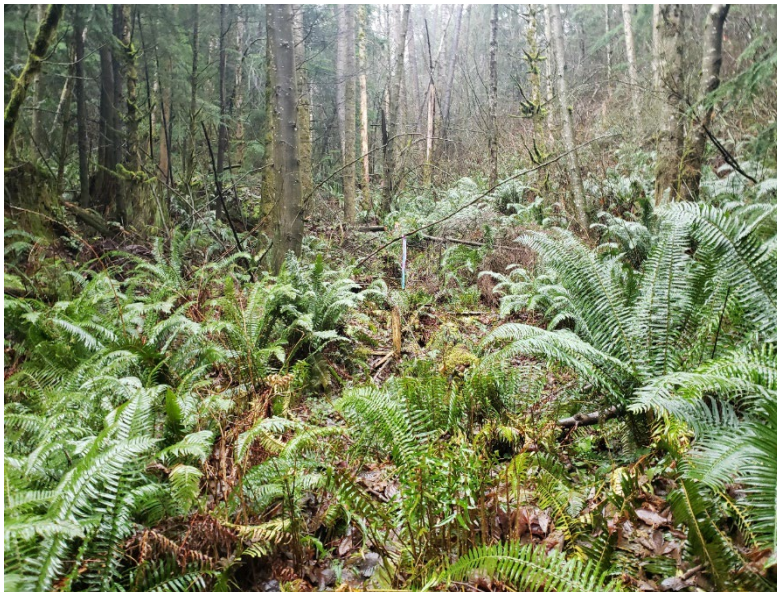
Figure 4: Typical upland forested area