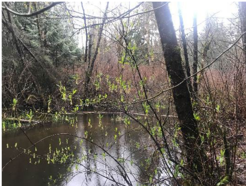
Figure 1: Lake Creek: stream and wetland/riparian habitat

There is suitable fish habitat within the project area. Anadromous fish species use the Raging River, Deep Creek, and Lake Creek. Stream and fish habitat within the immediate vicinity of fish barriers at the crossings with Lake Creek, Raging River and Deep Creek, as well as within, reach both upstream and downstream, are detailed in the Preliminary Hydraulic Design Reports for this project, and are available on request. Wetland complexes provide excellent habitat for both aquatic and terrestrial species. See figures 1 through 7 below: