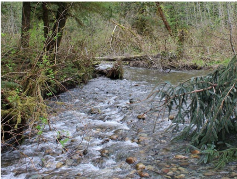
Figure 2: Deep Creek: stream and wetland/riparian habitat