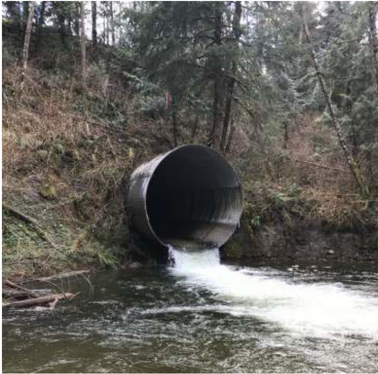
Figure 3: Deep Creek Culvert