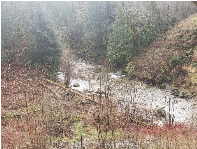
Figure 1: Raging River: stream and wetland/riparian habitat