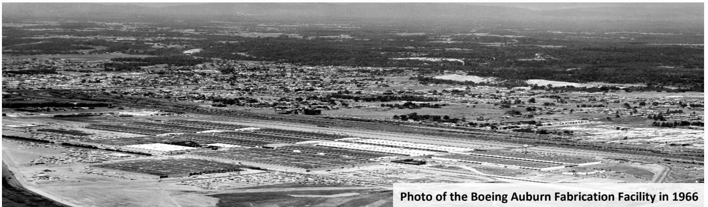
Photo of the Boeing Auburn Fabrication Facility in 1966