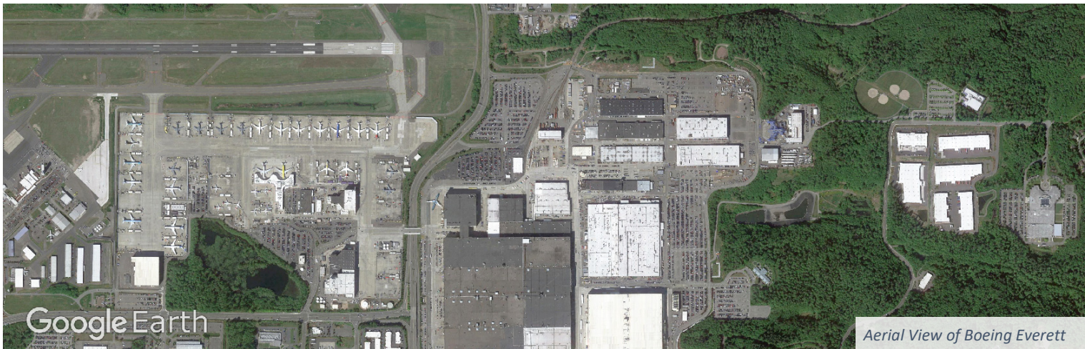
Aerial View of Boeing Everett