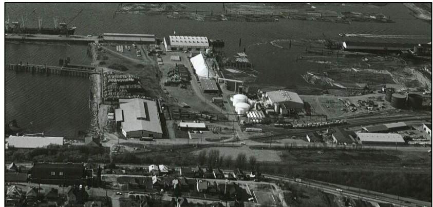
Chlor-Alkali Area operations facing northwest, 1969

A chlor-alkali plant operated in this area from 1965-1999. It used mercury to produce chlorine and sodium hydroxide for use at the pulp & tissue mill. Petroleum was also stored there. As a result, the 36-acre Chlor-Alkali Area contains mercury, high pH (caustic), polycyclic aromatic hydrocarbons (PAHs), and petroleum hydrocarbons at potentially harmful levels. These contaminants must be addressed under Washington's cleanup law, the Model Toxics Control Act ( MTCA 1 ).