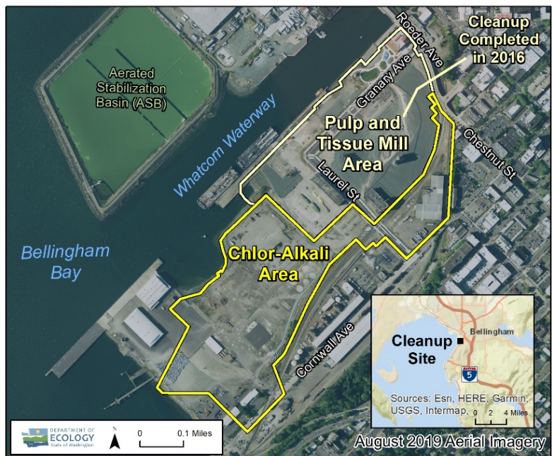
Aerial view of Georgia-Pacific West cleanup site

The Site is one of 12 sites coordinated through the Bellingham Bay Demonstration Pilot. The Pilot is a bay-wide multi-agency effort to clean up contamination, control pollution sources and restore habitat, with consideration for land and water uses.