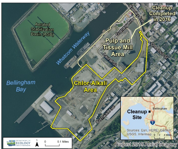
Aerial view of Georgia-Pacific West cleanup site