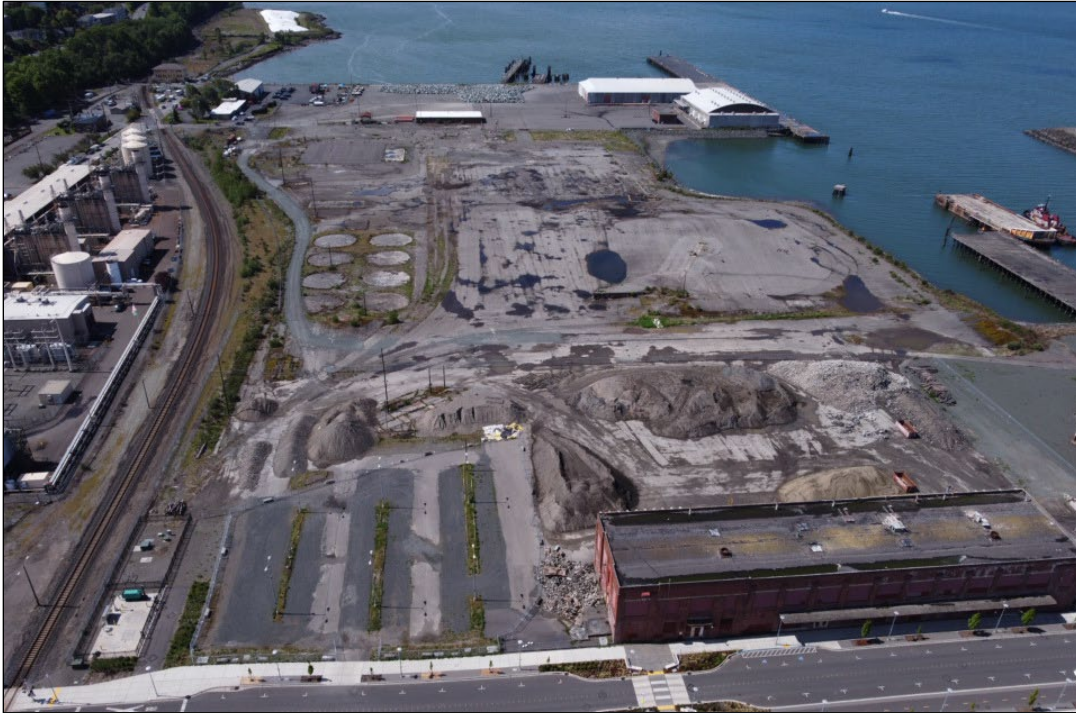
Chlor-Alkali Area of the Georgia-Pacific West Site facing southwest, May 2021

In June 2018, the Port, with Ecology oversight, completed a Feasibility Study assessing a range of cleanup options for the Chlor-Alkali Area of the Georgia-Pacific West site. Based on this work and an environmental study (Remedial Investigation) completed in 2013, Ecology has prepared a cleanup action plan to address contamination at the Chlor-Alkali Area.