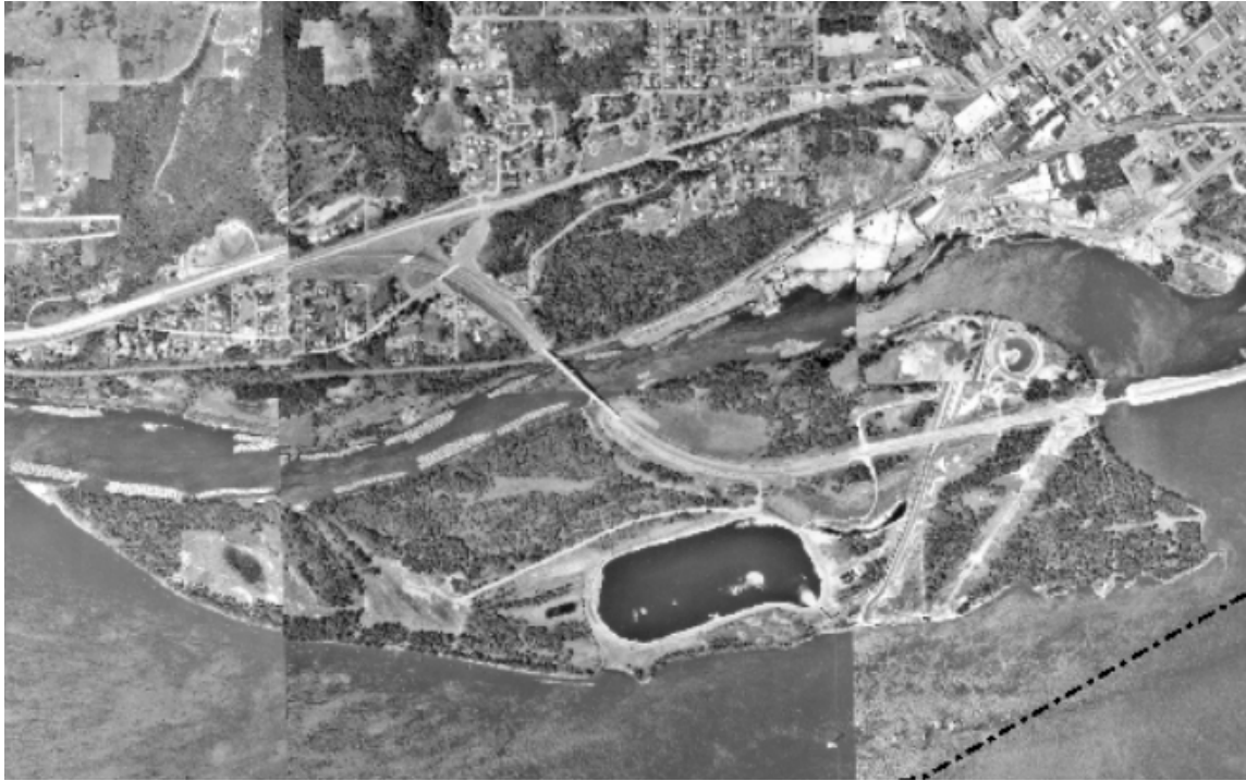
Figure 4. Aerial photography of site in 1968 provided by WA DNR and retrieved from Clark County Maps Online.