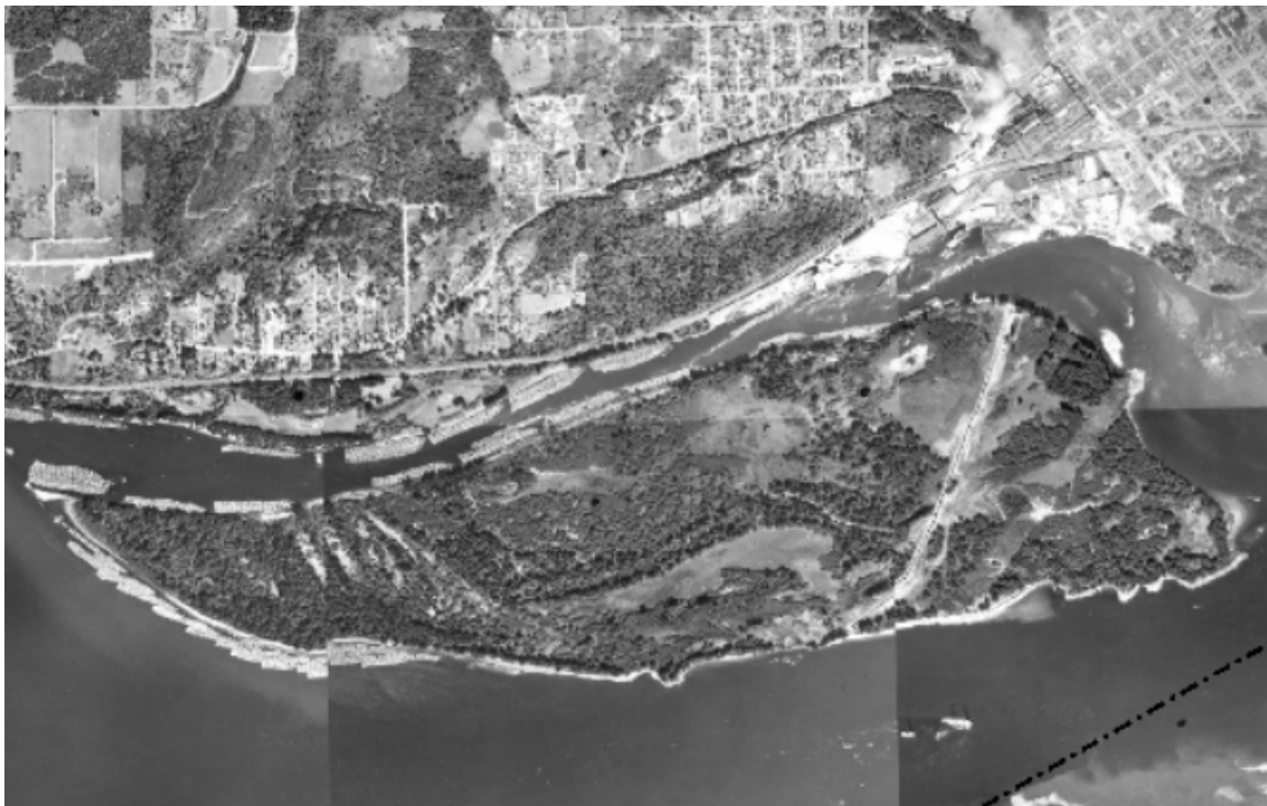
Figure 3. Aerial photography of site in 1955 showing Lady Island, provided by Pacific Aerial Surveys, Inc. and retrieved from Clark County Maps Online. Photography shows facility prior to the installation of wastewater treatment on Lady Island.