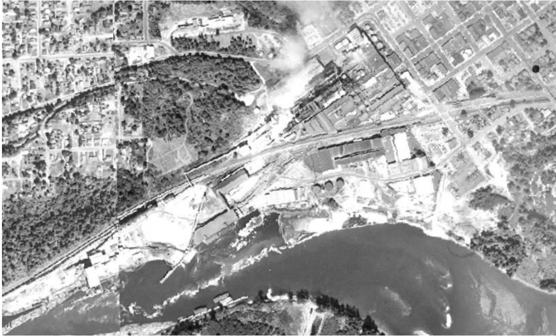
Figure 2. Aerial photography of site in 1955 provided by Pacific Aerial Surveys, Inc. and retrieved from Clark County Maps Online.