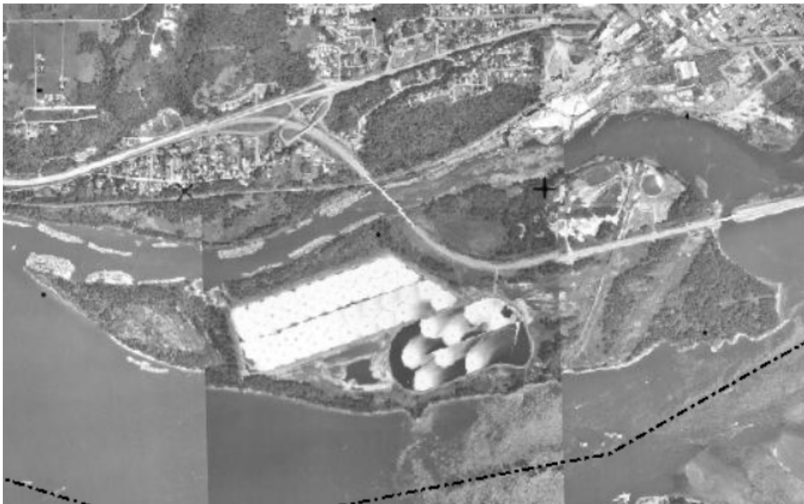
Figure 5. Aerial photography of site in 1978 provided by WA DNR and retrieved from Clark County Maps Online.