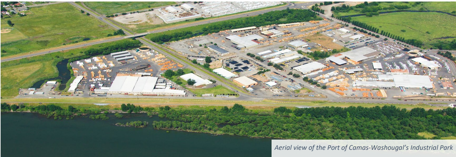
Aerial view of the Port of Camas-Washougal's Industrial Park