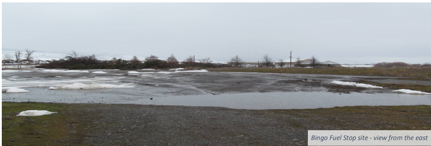
Bingo Fuel Stop site - view from the east