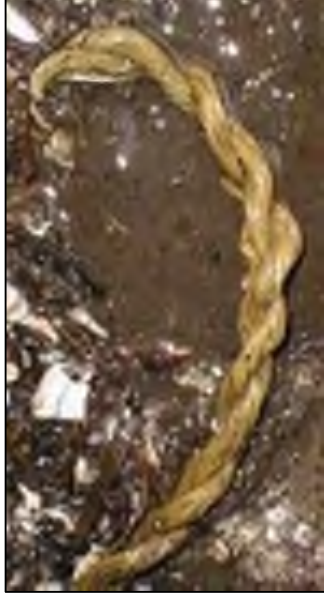
Left and Below: Culturally modified tree and an old carving on an aspen. These are examples of above ground cultural resources.