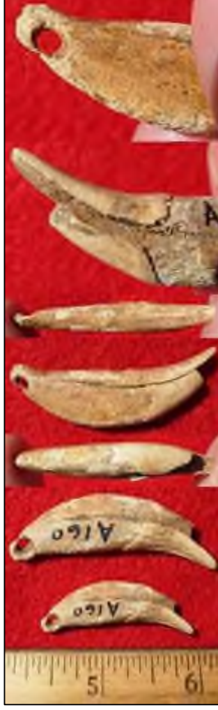
Upper Left: Bone Awls from Oregon.