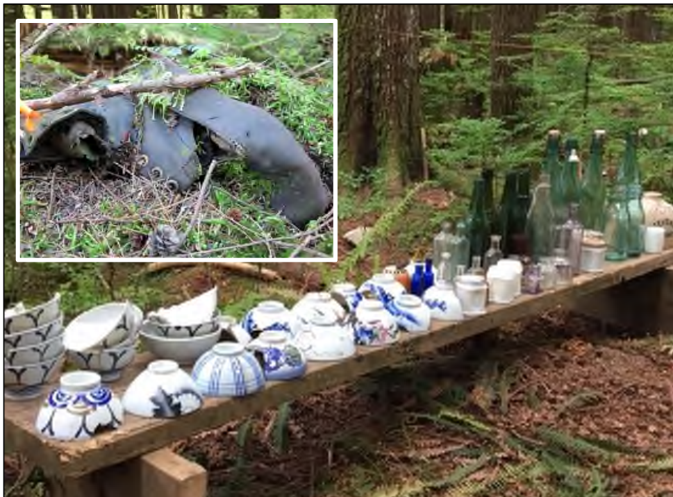
Main Image: Dishes, bottles, work boot found at the North Shore Japanese bath house (ofuro) site This is an example of an above ground resource.