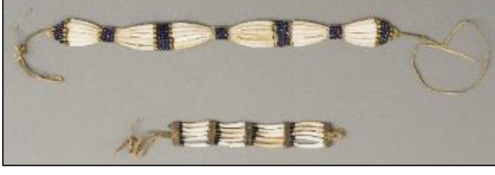
Above: Tooth Pendants. Right: Bone Pendants. Both from Oregon and Washington.