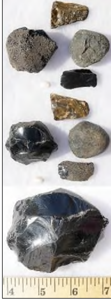
Stone artifacts from Oregon.