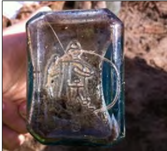
Far Left: .303 British cartridge found by a WCC planting crew on Skagit River. Don't ever touch something like this! Left: Maker's mark on bottom of old bottle.