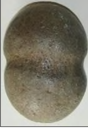
Above: Fishing Weight