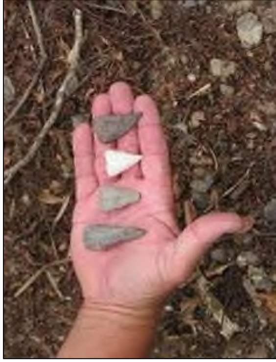
Stone artifacts from Washington.