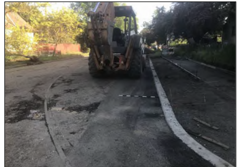
Counter Clockwise, Left to Right: Historic structure 45KI924, in WSDOT right of way for SR99 tunnel. Remnants of Smith Cove shantytown (45-KI-1200) discovered during Ecology CSO excavation, City of Spokane historic trolley tracks (above ground historic resources) uncovered during stormwater project, intact foundation of historic home that survived the Great Ellensburg Fire of July 4, 1889, uncovered beneath parking lot in Ellensburg.