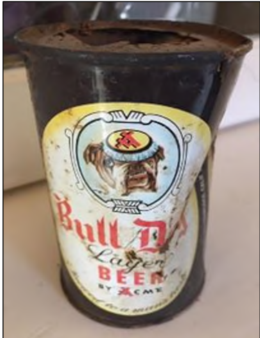
Right: Old beer can found in Oregon. ACME was owned by Olympia Brewery.