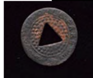
Right, from Top to Bottom: Coins, token, spectacles and Montgomery Ward pitchfork toy discovered during Seattle Smith Cove shantytown (45-KI-1200) excavation.