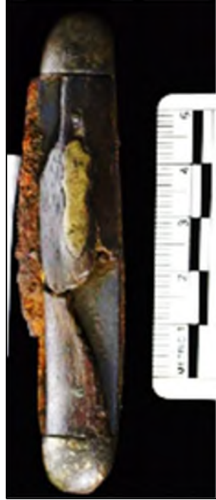
Right: Collections of historic artifacts discovered during excavations in eastern Washington cities.