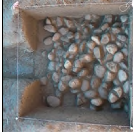
Underground oven.