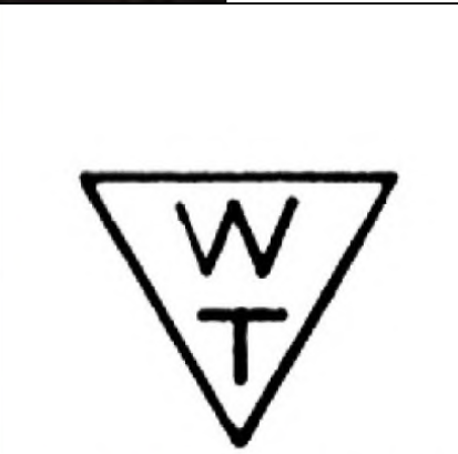
Logo employed by Whithall Tatum & Co. between 1924 to 1938 (Lockhart et al. 2016).