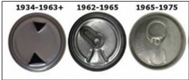
Can opening dates, courtesy of W.M. Schroeder.