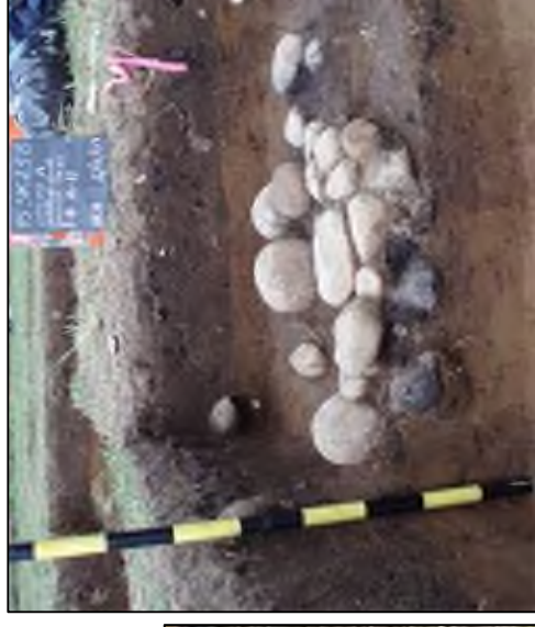
Hearth excavated near Hamilton, WA.