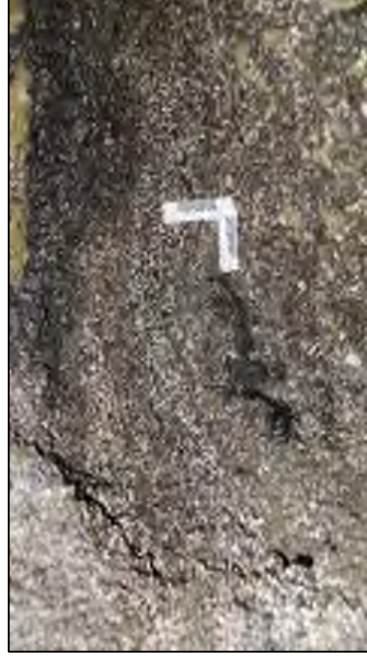
Shell midden with fire cracked rock.