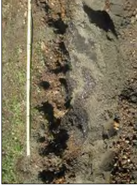
Shell Midden pocket in modern fill discovered in sewer trench.