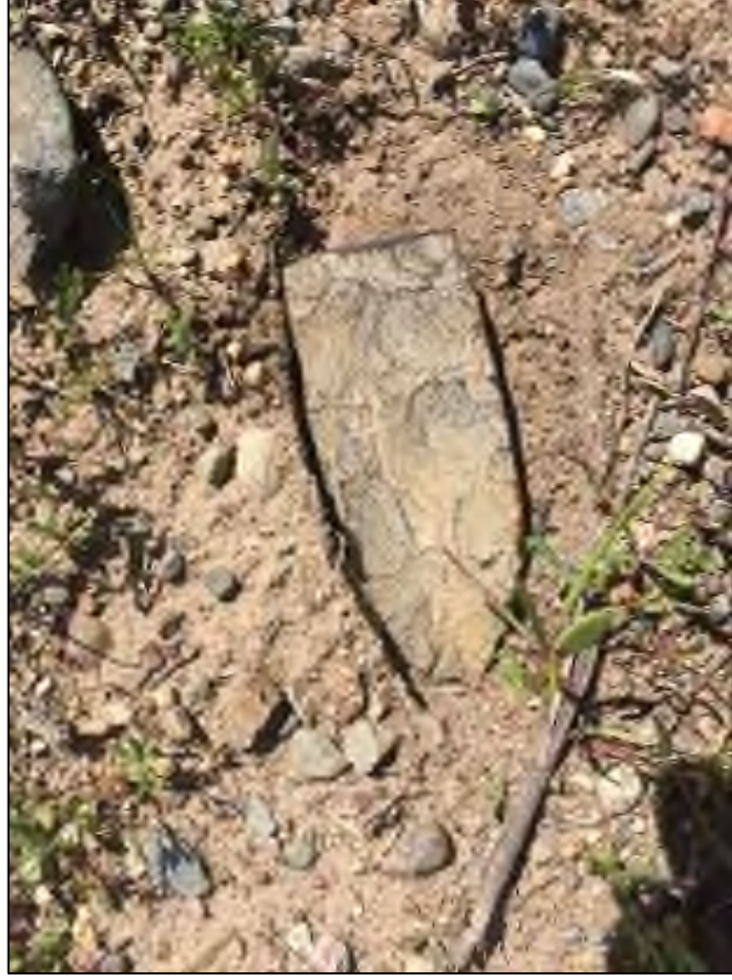
Biface-knife, scraper, or pre-form found in NE Washington. Thought to be a well knapped object of great antiquity.