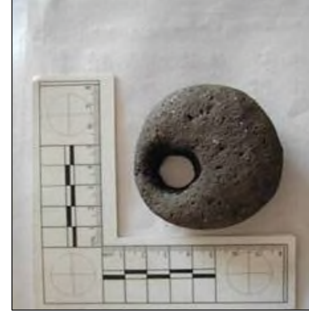
Artifacts from unknown locations (left and right images).