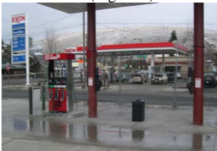
North Colfax Petroleum Site

The site lies along the east side of North Main Street at the intersection of East Tyler and East Harrison Streets. The site is approximately 1000 feet south of the Palouse River and east of the South Fork of the Palouse River (Figure 1).