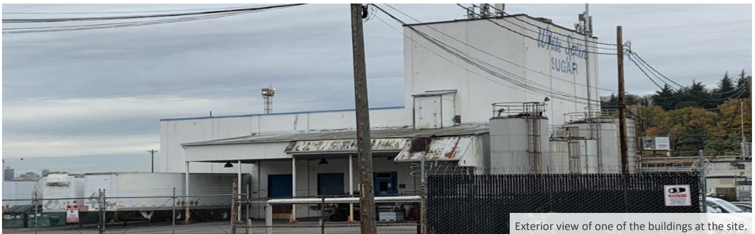
Exterior view of one of the buildings at the site.