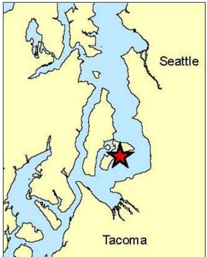
Maury Island Open Space park, Maury Island

If you need this publication in an alternative format call reception at 425-649-7000. Persons with hearing loss, call 711 for Washington Relay Service. Persons with a speech disability, call 877-833-6341.