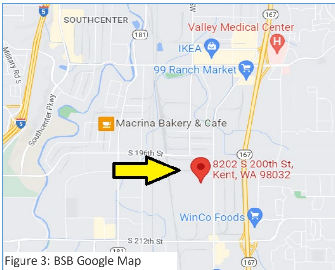
Figure 3: BSB Google Map