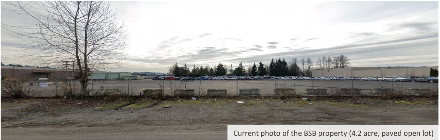
Current photo of the BSB property (4.2 acre, paved open lot)