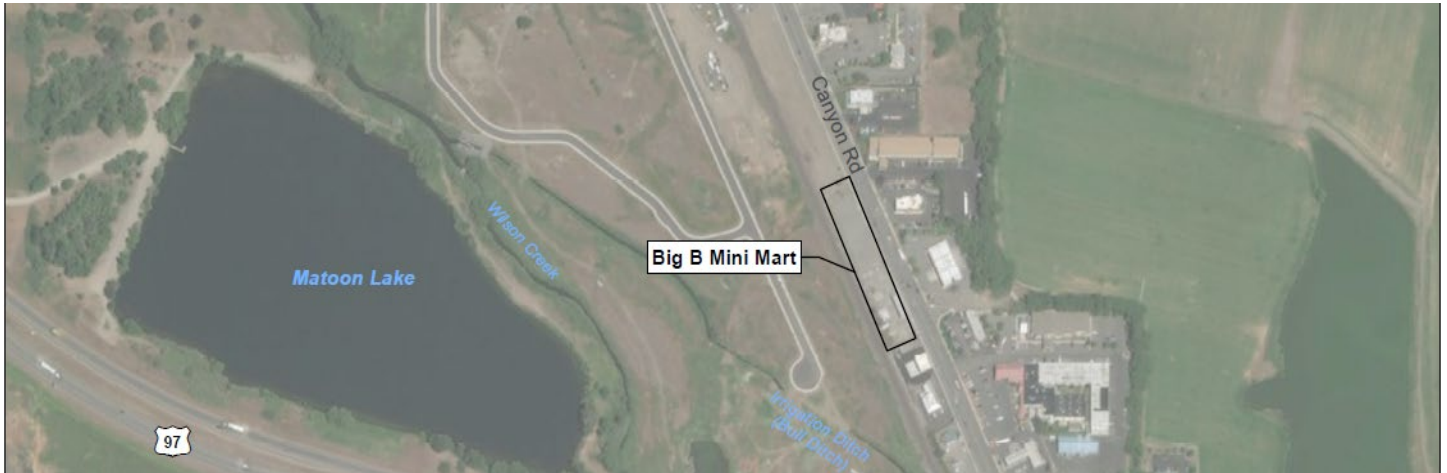
Big B Mini Mart – Photo courtesy of Floyd Snider 2018 RI/FS report