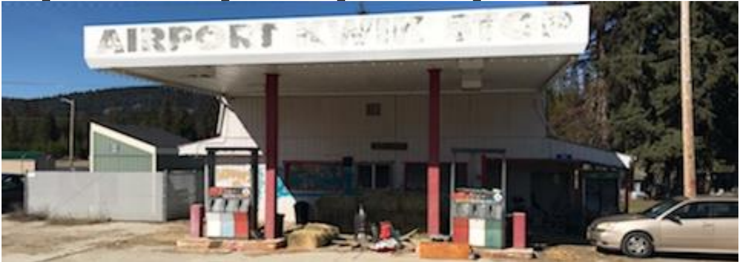
Figure 1. The Washington Department of Ecology is proposing to excavate contaminated soil and at the closed Airport Kwik Stop.