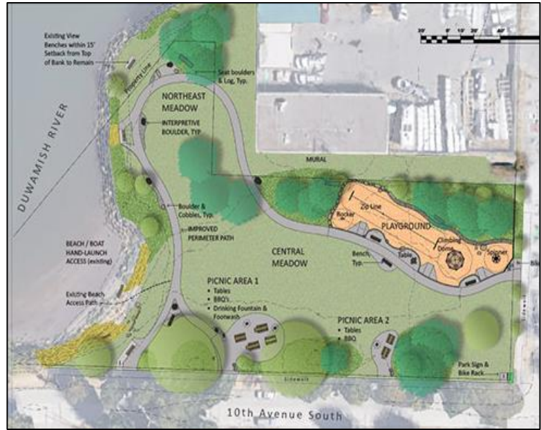
Sawirka farsamo ee muujinaya hormarka wakhtiga iyo la sugayo ee

Asxaabta Duwamish Waterway Park waxa uu hogaaminayaa dadaalka sanado badan oo lagu turjubayo himilada bulshada ee beeraha nasashada xaafada ee rasmiga ah ee nashqada ugu danbaysa. La shaqaynta SPR iyo Seattle Parks Foundation, Friends of Duwamish Waterway Park waxa ay uruuriyeen malaayiin doolar oo hormarinta beerta nasashada. Dhismaha waxaa la dhameeyay dhamaadka 2022. Hagaajinta goobtu waxay bilaabantay 2020 oo ilaa maanta way soo socotaa.