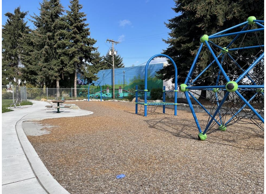
Aaga lagu ciyaaro ee Duwamish Waterway Park, Sebteember 2022

Barnaamijka Nadiifinta Ikhtiyaarka ah (Voluntary Cleanup Program 3 , VCP) waxay u suurto gelisay mulkiilayaasha goobaha wasakhaysan inay buuxiyaan heerarka nadiifinta gobolka sida uu dhigayo MTCA madaxa banaan iyo inay helaan tilmaamo farsamo oo ay ka helaan Waaxda Bay'ada inta ay socoto shaqadu. VCP waxay u suurto gelinaysaa mulkiilayaasha inay ku shaqeeyaan qandaraas halki ay ku shaqayn lahaayeen amarka sharciga ah ee Waaxda Bay'ada. Ka qayb galayaasha VCP waxay siiyaan khidmad Waaxda Bay'ada si waaxdu ugu bixiso kahrashka tilmaamaha iyo qiimaynta. Goobaha VCP waa inay buuxiyaan heerar nadiifin oo lamid ah sida hantiyaha ay hore u maamuli jirtay Waaxda Bay'ada ee hoos yimaada MTCA.