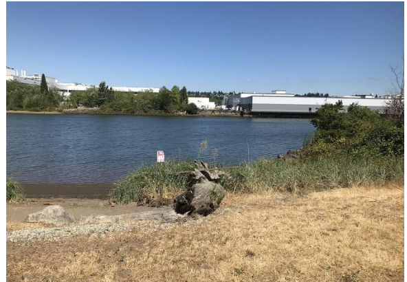
Muuqaalka Lower Duwamish Waterway ee Duwamish Waterway Park, Agoosto 2022

Goobta Duwamish Waterway Park waxaa weeye habayn Goobta Lower Duwamish Waterway 4 Superfund, oo waxaa kamid ah 5 mayl oo la lugeeyo Wabiga Duwamish. Hay'ada Ilaalinta Deegaanka (Environmental Protection Agency, EPA) ee Maraykanka waxay ku dareen Goobta LDW Superfund 5 ee Liiska Mudnaanta Qaran ee Superfund 2001. Waaxda Bay'ada waxay ka shaqaynaysaa sidii ay u joojin lahayn ama u yarayn lahayd ilaha wasakhda ee Goobta LDW Superfund, dadaalka oo loo yaqaan " xakamaynta isha " 6 , si markaa EPA ay uga shaqayso nadiifinta webiga dushiisa.