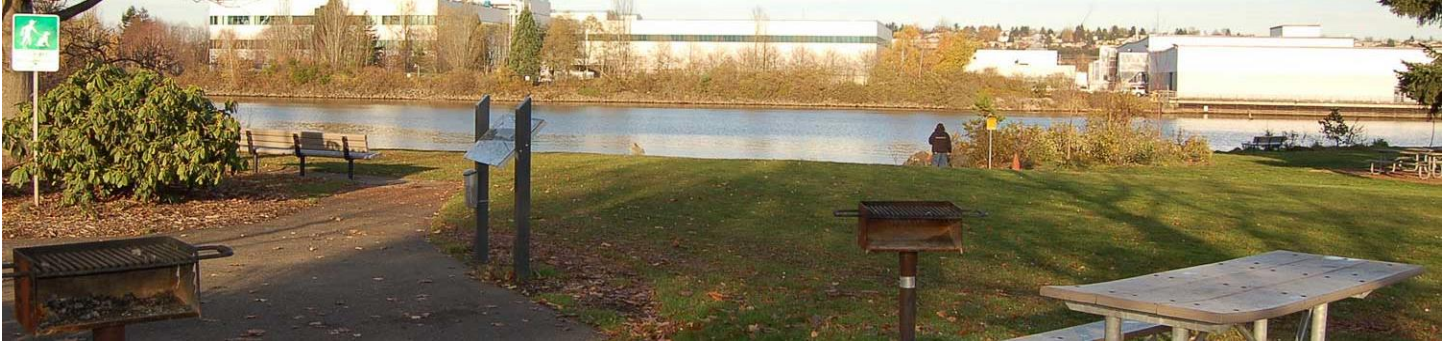
Duleedka Biyaha Duwamish Waterway Park (Waxaa Iska leh Magaalada Seattle))