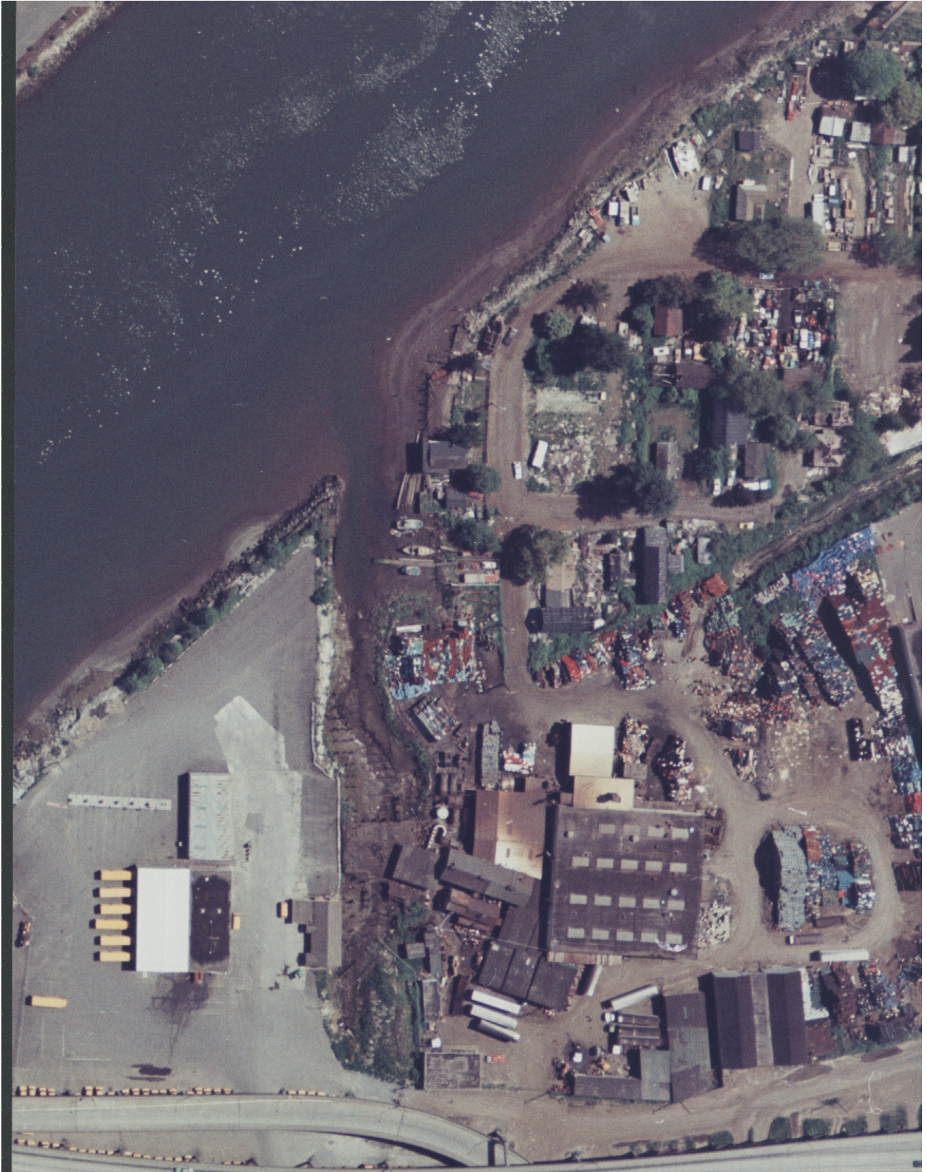
Date: May 4, 1980 Figure P-8 ICS-NWC RI Dalton, Olmsted & Fuglevand Inc.