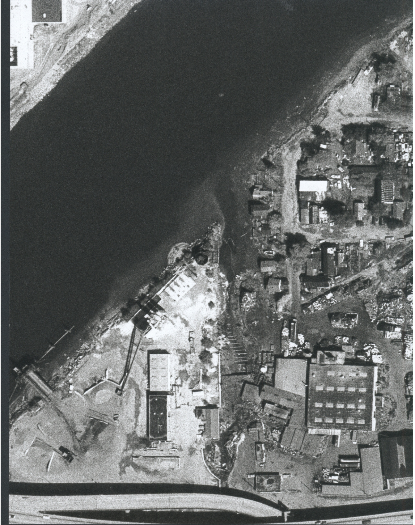
Date: April 22, 1977 Figure P-7 ICS-NWC RI Dalton, Olmsted & Fuglevand Inc.