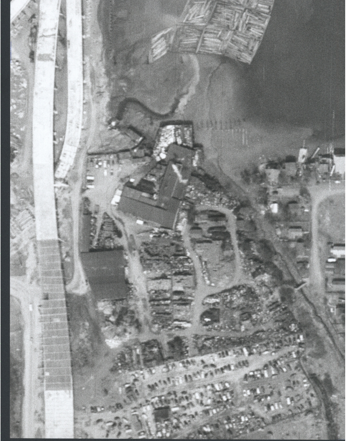
Date: April 10, 1956 Figure P-3 ICS-NWC RI Dalton, Olmsted & Fuglevand Inc.