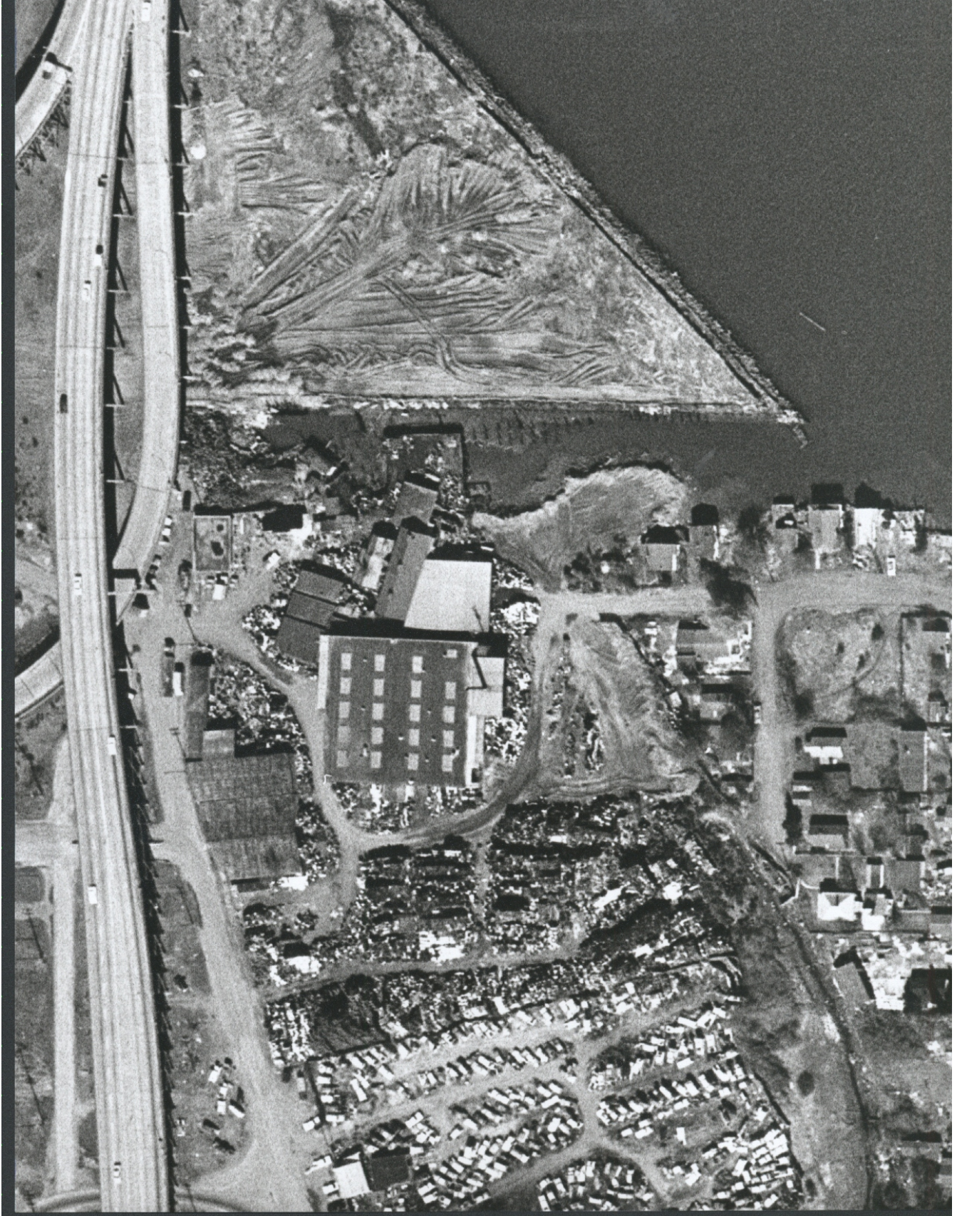
Date: March 25, 1969 Figure P-5 ICS-NWC RI Dalton, Olmsted & Fuglevand Inc.