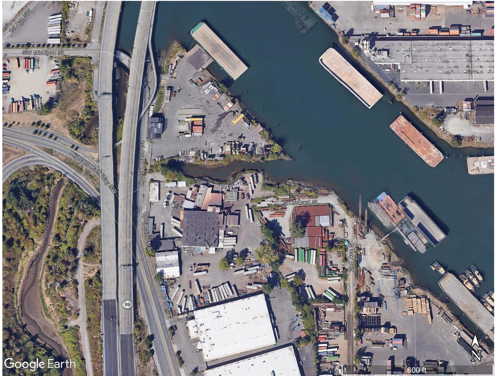
Date: May 2018 Figure P-15 ICS-NWC RI Dalton, Olmsted & Fuglevand Inc.