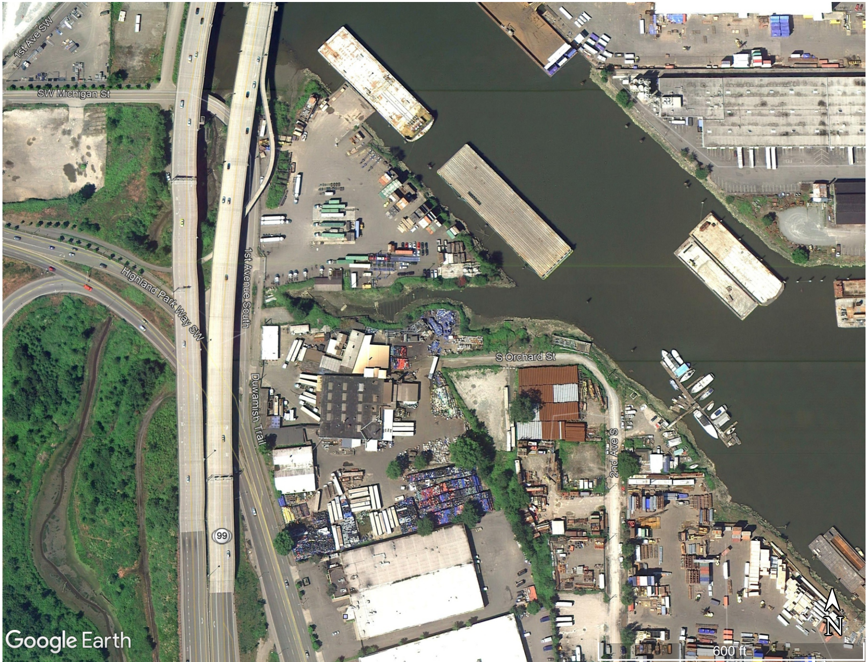
Date: June 2010 Figure P-14 ICS-NWC RI Dalton, Olmsted & Fuglevand Inc.