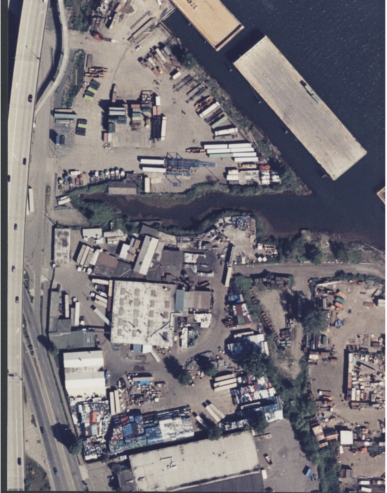
Date: April 25, 2004 Figure P-13 ICS-NWC RI Dalton, Olmsted & Fuglevand Inc.