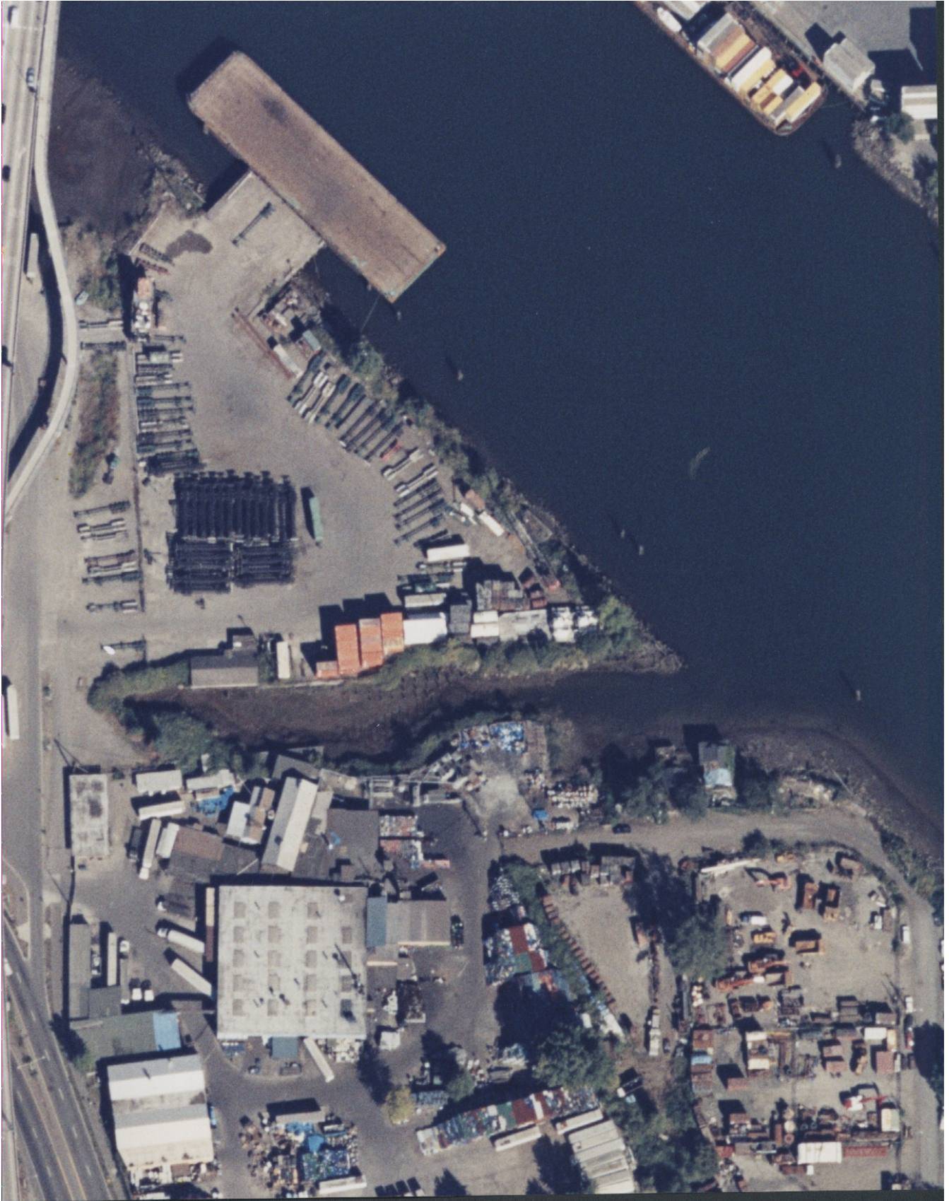
Date: September 22, 2002 Figure P-12 ICS-NWC RI Dalton, Olmsted & Fuglevand Inc.