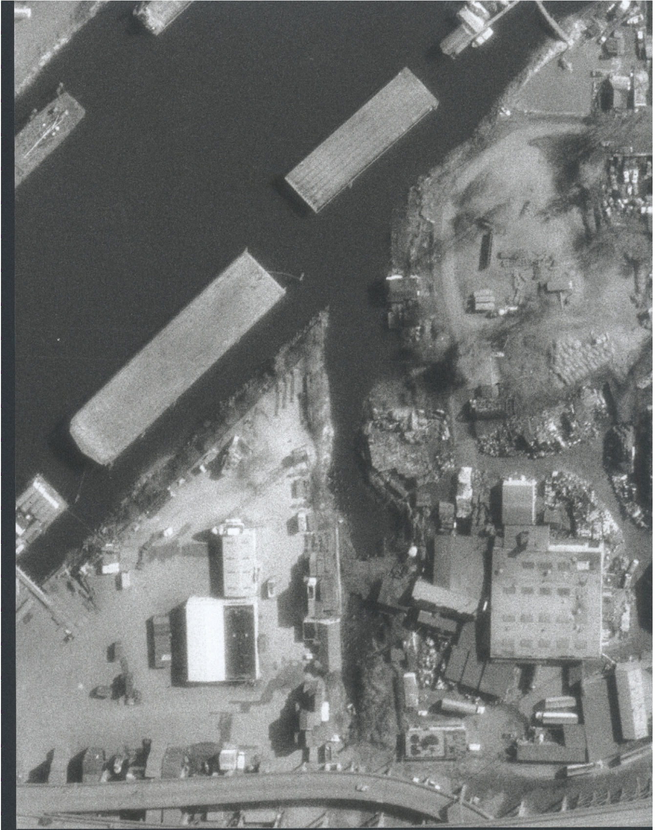
Date: March 3, 1985 Figure P-9 ICS-NWC RI Dalton, Olmsted & Fuglevand Inc.