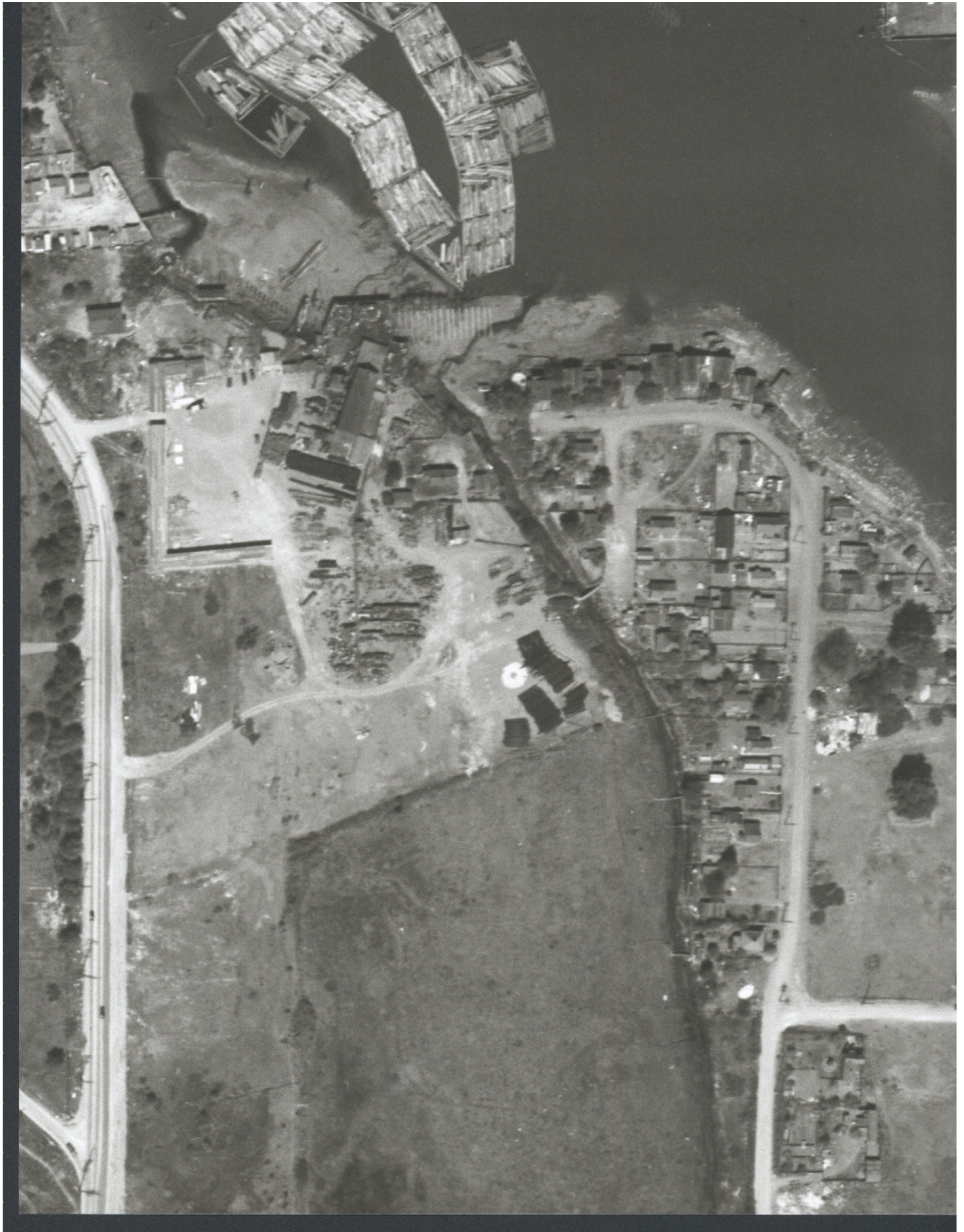
Date: 1946 Figure P-2 ICS-NWC RI Dalton, Olmsted & Fuglevand Inc.