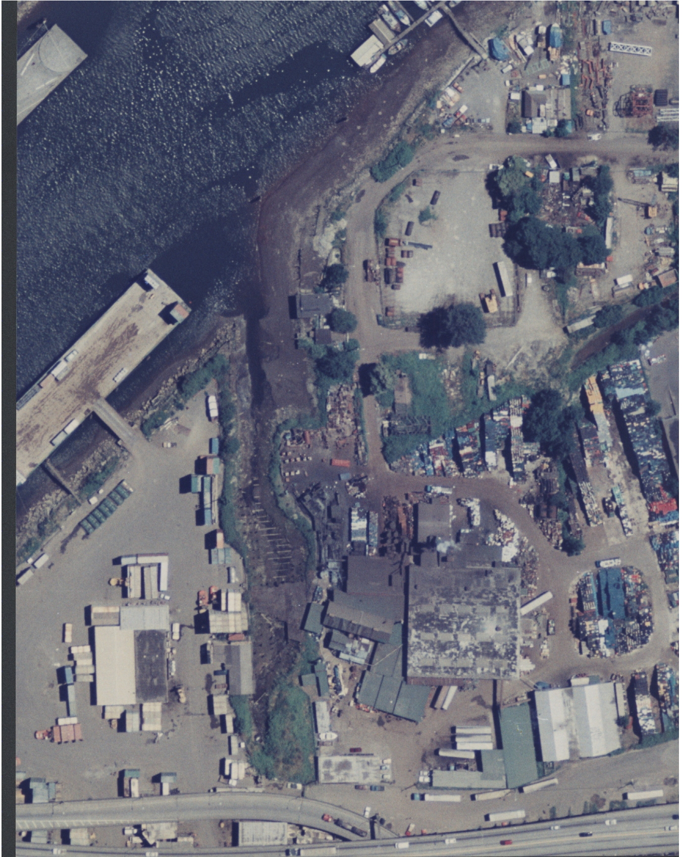
Date: July 10, 1990 Figure P-10 ICS-NWC RI Dalton, Olmsted & Fuglevand Inc.