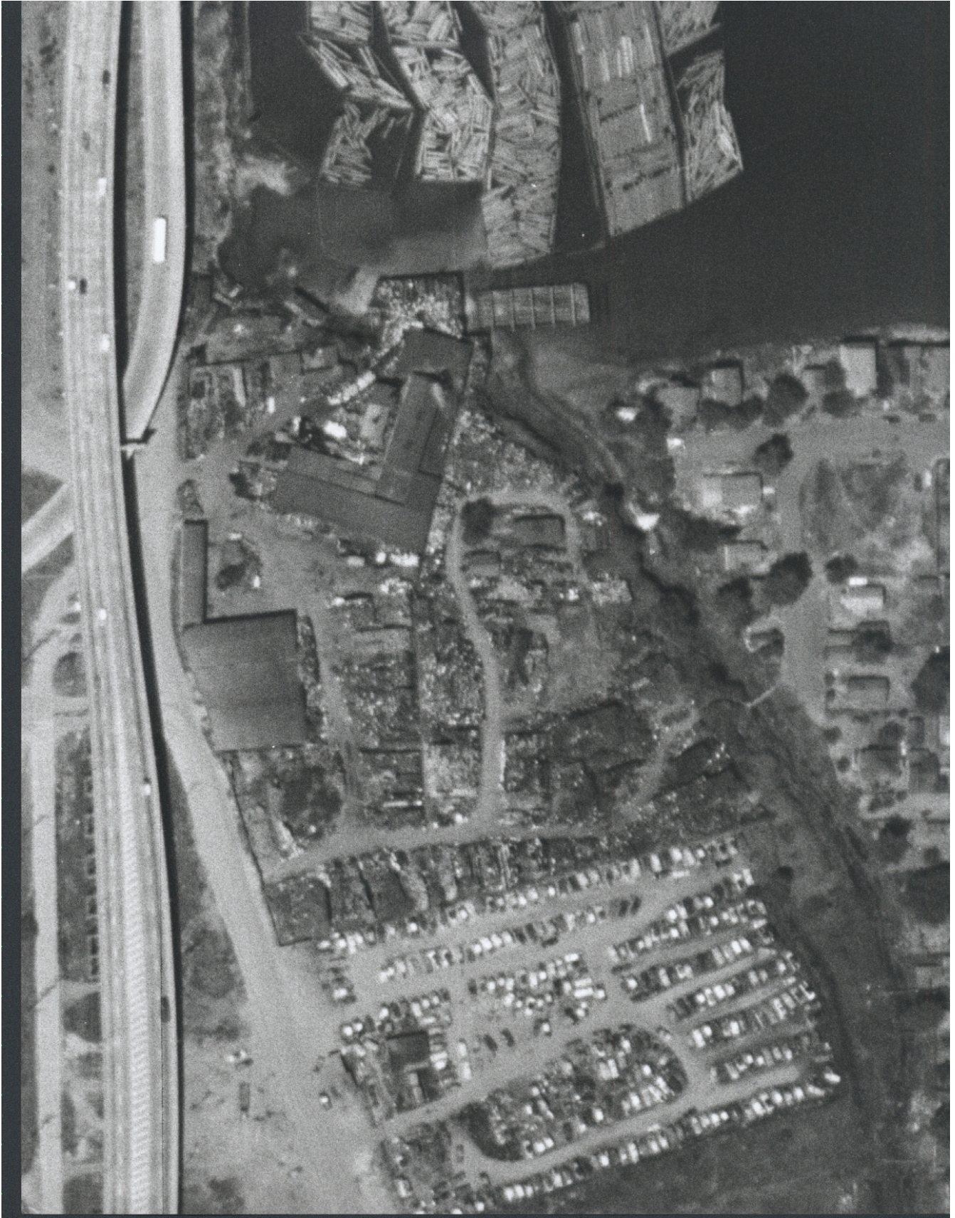
Date: June 23, 1960 Figure P-4 ICS-NWC RI Dalton, Olmsted & Fuglevand Inc.