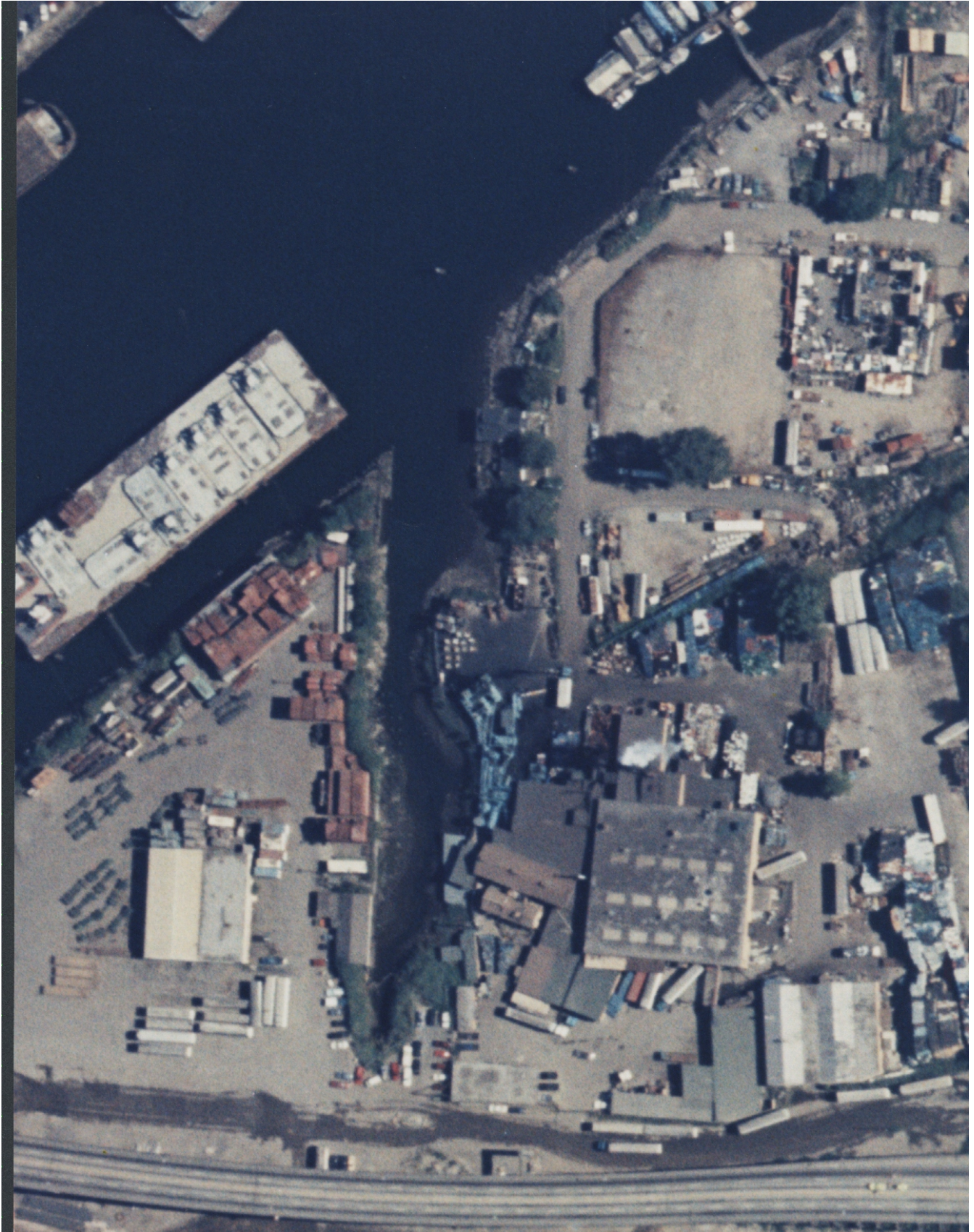
Date: September 22, 1995 Figure P-11 ICS-NWC RI Dalton, Olmsted & Fuglevand Inc.