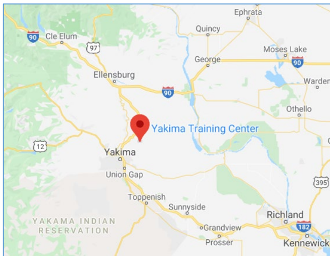
Location of Yakima Training Center (Google map)

Enforcement order and corrective action permit Ecology seeks public comment on documents issued to the U.S. Army related to hazardous materials released at the Yakima Training Center.