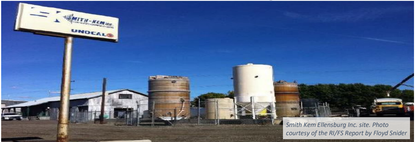
Smith Kem Ellensburg Inc. site.