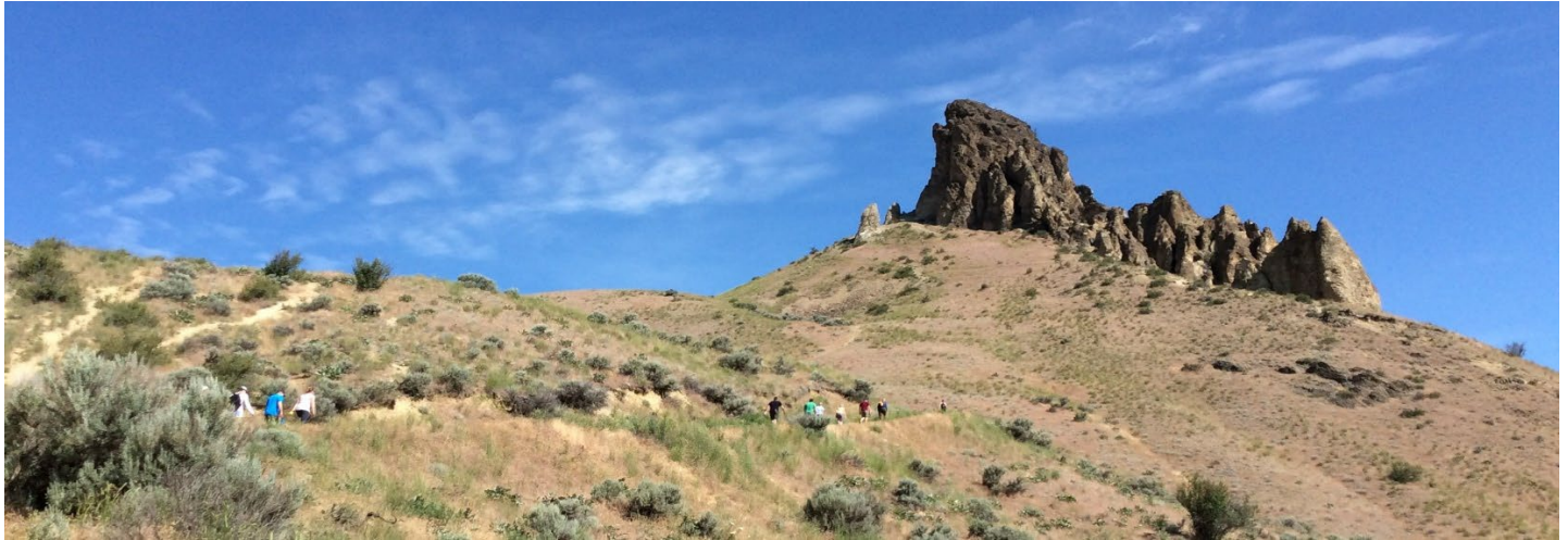
Gold Knob Prospects a.k.a. Saddle Rock Natural Area with hikers on a trail