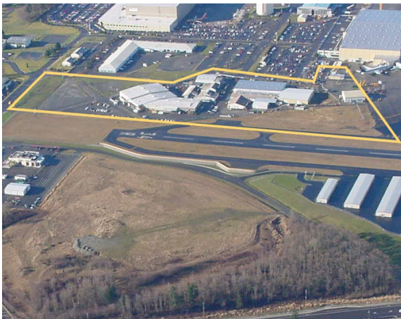
Boundary of the Site from the east