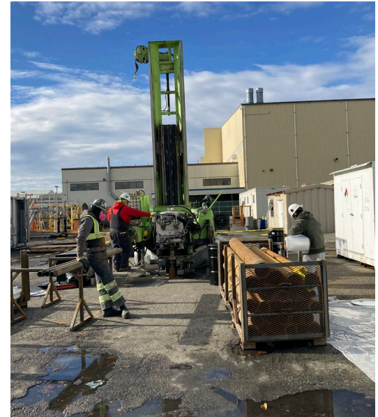
Soil boring and well installation, Building C-29, Nov 2022

Contaminated Soil Excavation: In 2011 at Building C-19, shallow soil contaminated with TPH-D and TPH-O was excavated from below the building in several limited areas. Ecology issued this portion of the Site a no further action necessary letter in 2013 for soil contaminated with TPH.