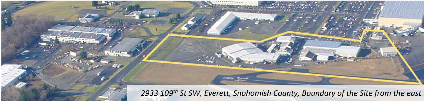
2933 109 th St SW, Everett, Snohomish County, Boundary of the Site from the east