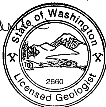
Douglas J. Lee

Figure 1: Potentiometric Map Table 1: Groundwater Monitoring Data and Analytical Results Table 2: Groundwater Analytical Results Table 3: Field Measurements Attachments: Standard Operating Procedure - Groundwater Sampling Field Data Sheets Chain of Custody Document and Laboratory Analytical Reports