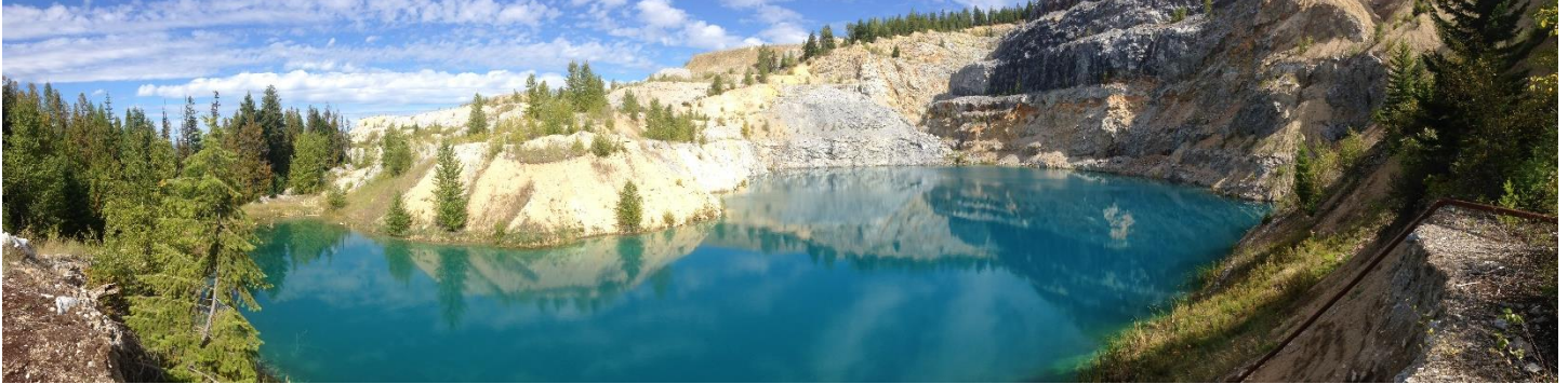
West End Pit Lake in the Waste Rock Area, 2014.