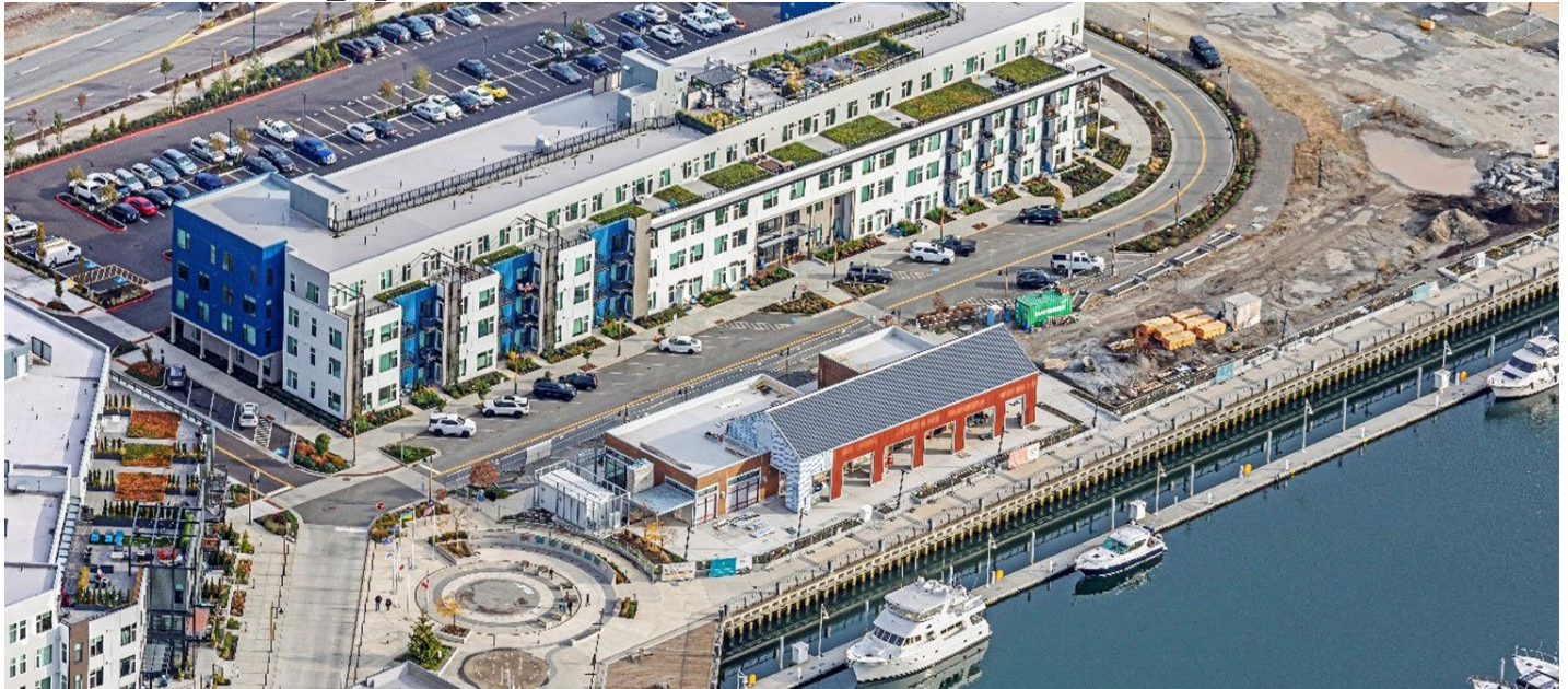
Aerial view of Everett Shipyard.