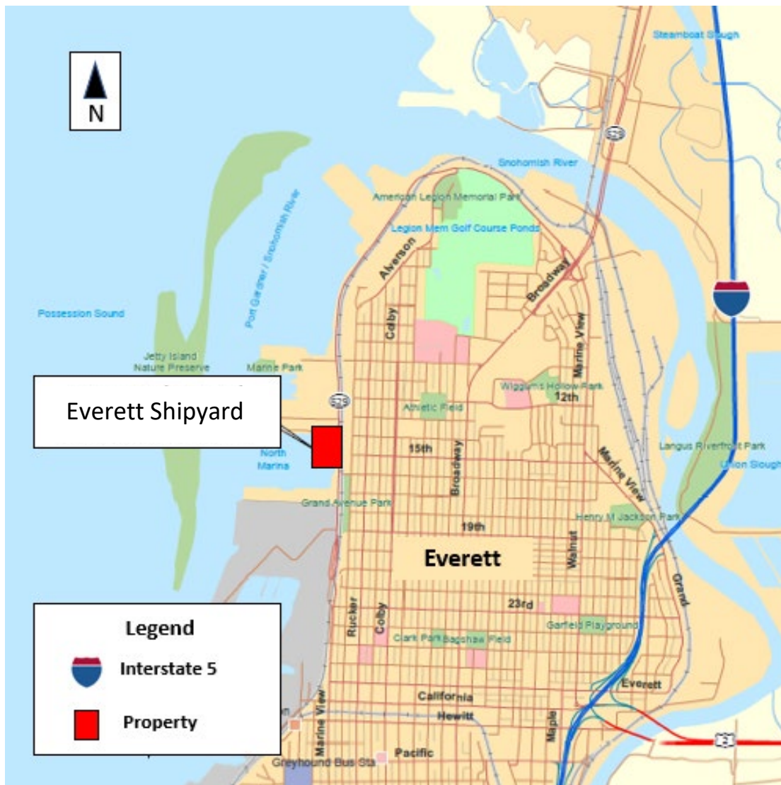
Figure 1: Map showing the approximate location of the Everett Shipyard site in Everett, Washington

You can find the Five-Year Periodic Review in person at the Department of Ecology, or the Everett Library listed on the first page of this fact sheet. Or you can view them and other project documents on the project website at: https://apps.ecology.wa.gov/cleanupsearch/site/3655