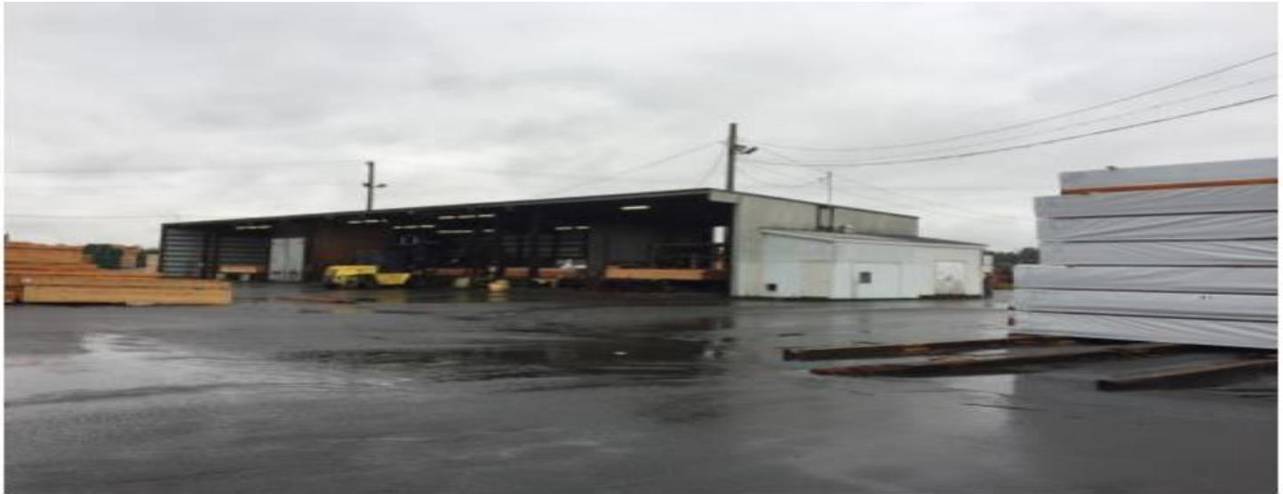
Photo of Buse Timber & Sales