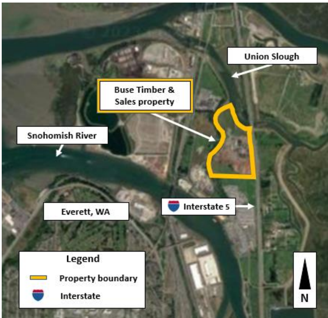
Figure 2: Map showing the location of the Buse Timber & Sales in Everett, Washington

You can find the draft Public Participation Plan and the draft Agreed Order in person at the Department of Ecology, and the Everett Library listed on the first page of this fact sheet. Or, you can view them and other project documents on the project website at: https://apps.ecology.wa.gov/cleanupsearch/site/4340#site-contaminants