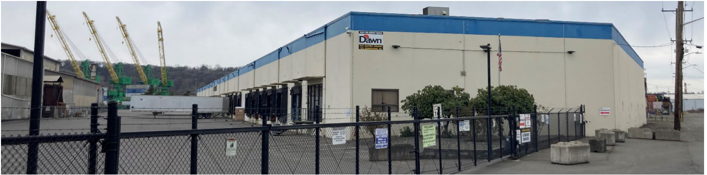
Dhismaha Wayn ee Alaabaadka Cuntada Dawn