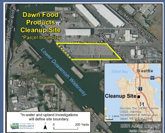
Khariirada guud ee Dawn Food Products nadiifinta goobta

Si aad u dalbato qaabilaada ADA, kala xidhiidh Bay'ada taleefanka 425-533-5537 ama iimeelka LDW@ecy.wa.gov , or visit ecology.wa.gov/Accessibility . Adeegyada Dadka Laxaadka La' ama TTY la hadal 711 ama 877-833-6341.