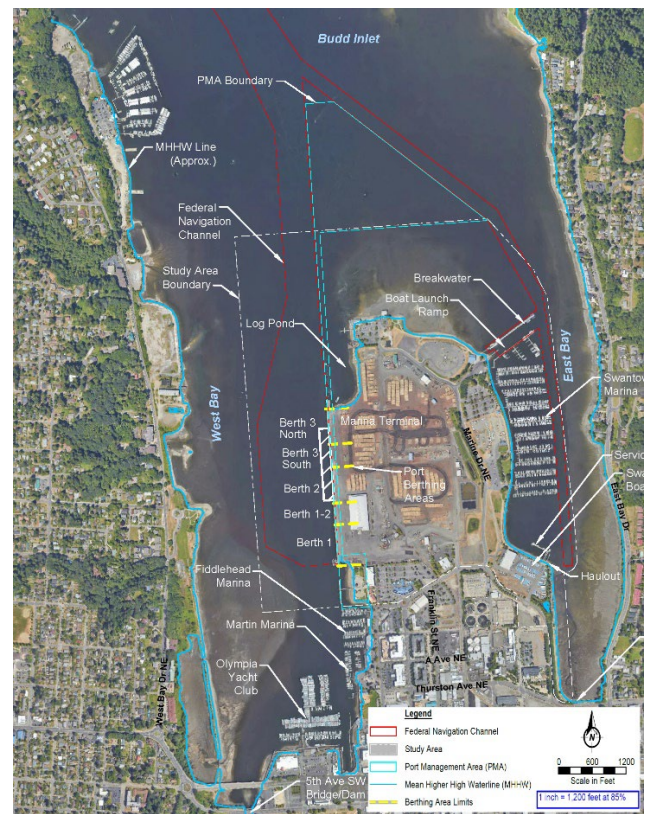
Figure 2. Map of Budd Inlet indicating the Port Management Area (PMA), the Study Area as well as the Federal Navigation Channel and berthing area limits. Visit the site webpage for more information:

https://apps.ecology.wa.gov/cleanupsearch/site/2245