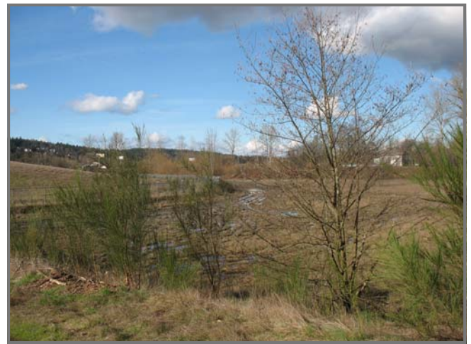
Wetland adjacent to the site