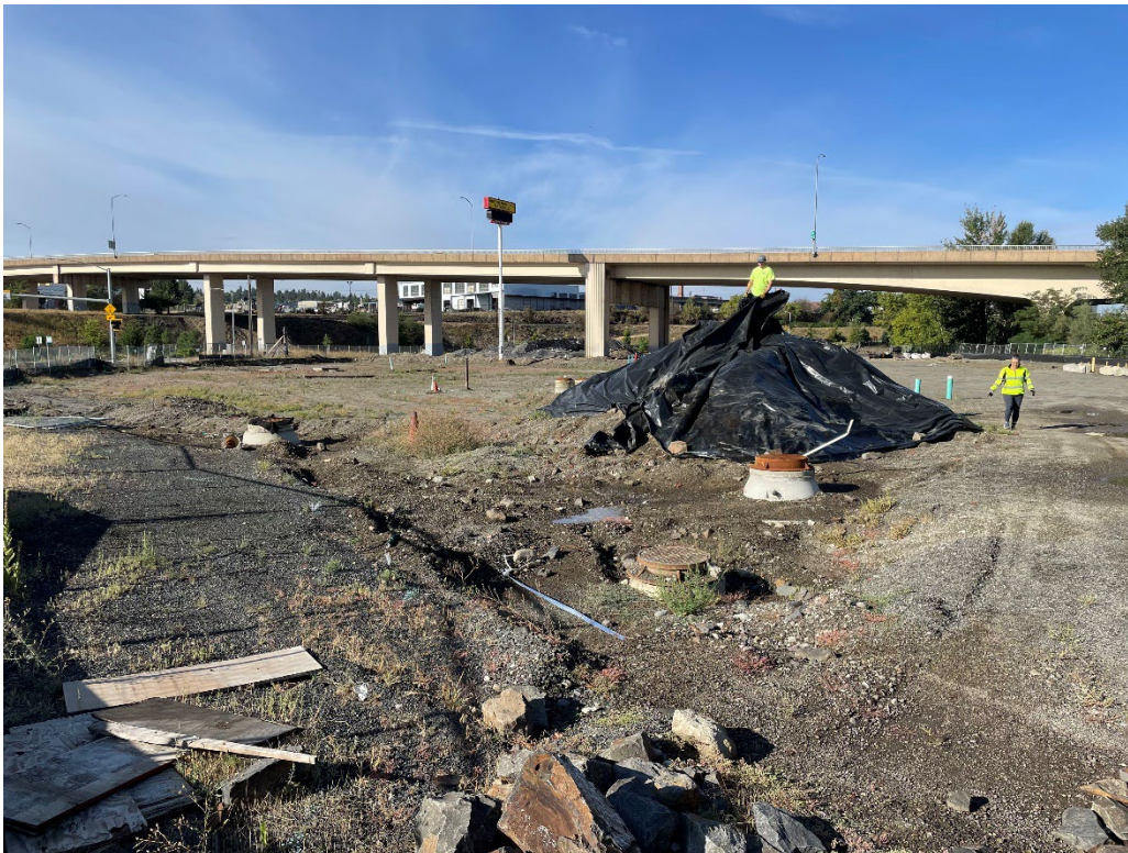
Photograph 4: Photo of stockpile being covered in the northeast portion of the Site (view to the west).