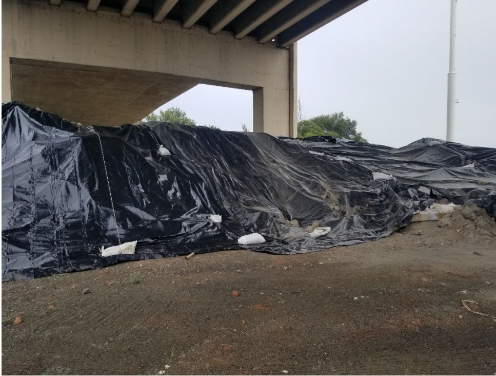
Photograph 3: Photo of covered stockpile beneath the Hamilton Street Bridge (view to the north).