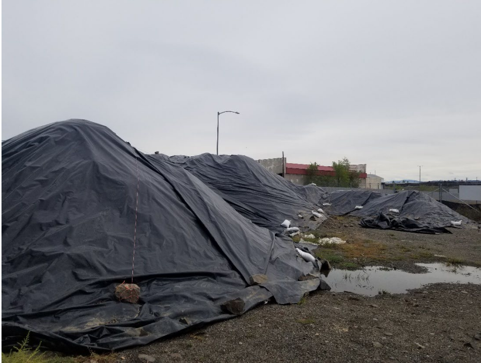
Photograph 1: Photo of covered stockpiles in the northeast section of the Site, west of the northeast infiltration gallery (view to the east).