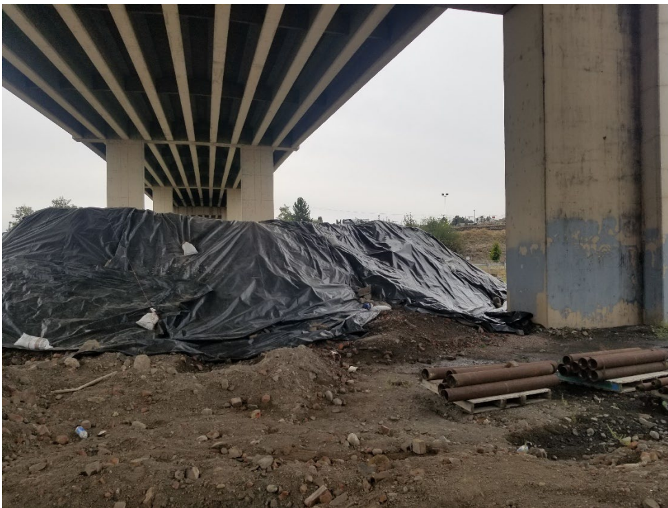
Photograph 2: Photo of covered stockpile beneath the Hamilton Street Bridge (view to the south).