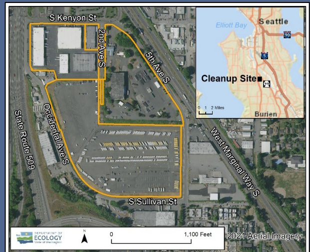
Aerial map of the South Park Landfill cleanup site, 2021

To request an ADA accommodation, contact Ecology by phone at 425-229-3683 or email LDW@ecy.wa.gov , or visit ecology.wa.gov/Accessibility . For Relay Service or TTY call 711 or 877-833-6341.