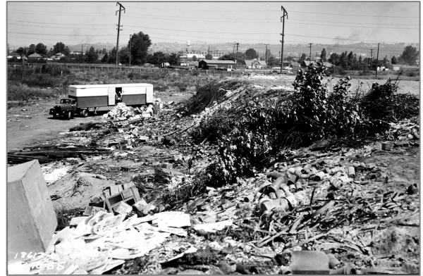
South Park Landfill historical use, circa 1950s