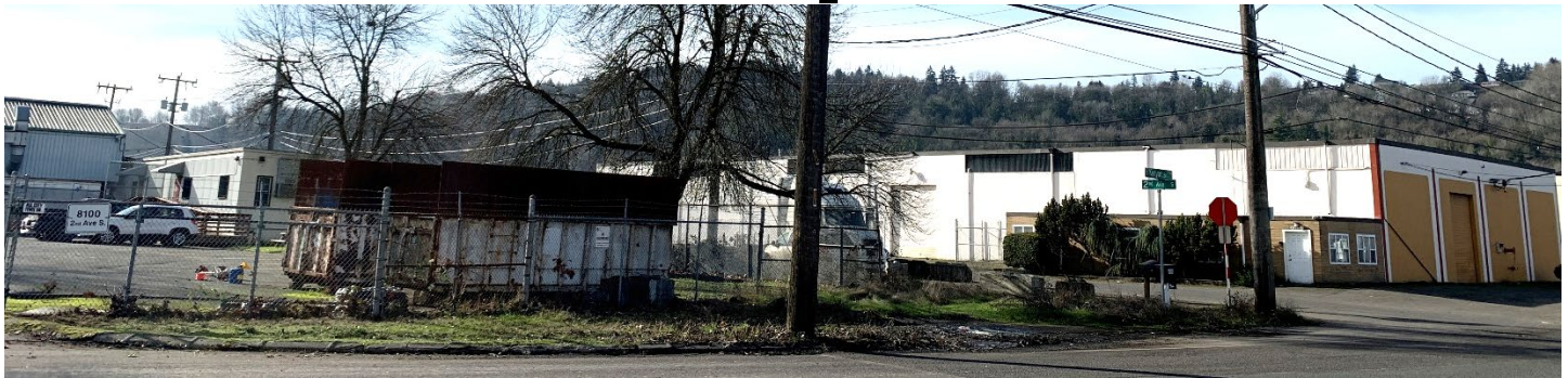
South Park Landfill Cleanup Site from S. Kenyon Street