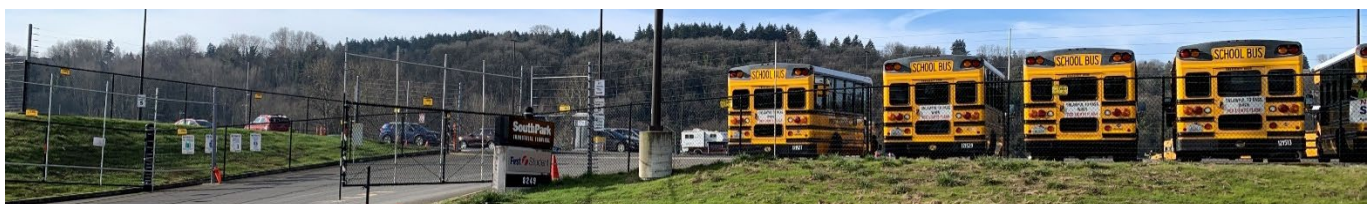
South Park Property Development (SPPD) from 5th Avenue S.