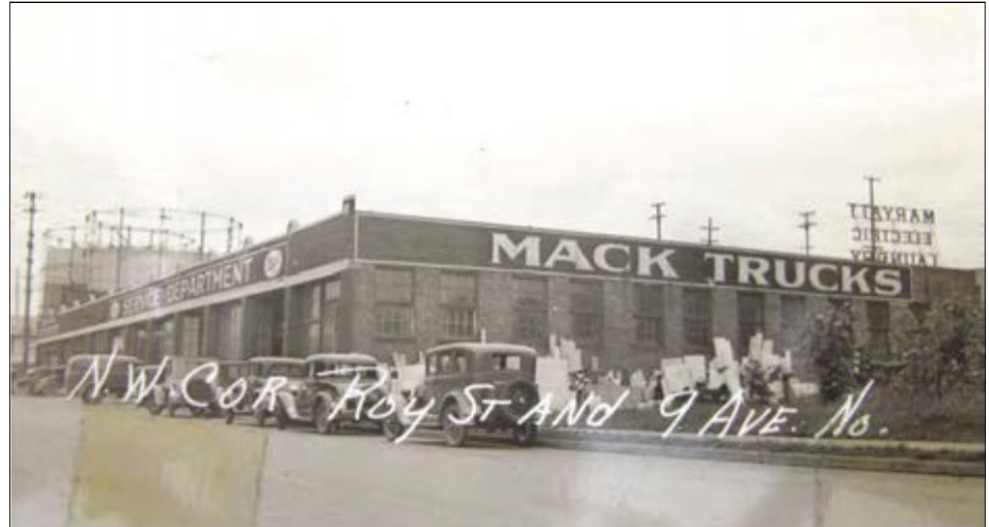
A 1937 historic photo showing the Mack Trucks service center and showroom on the property.

If no changes are made, Ecology will finalize the documents and the PLPs will proceed with the RI, FS, preliminary dCAP, and any interim cleanup actions.