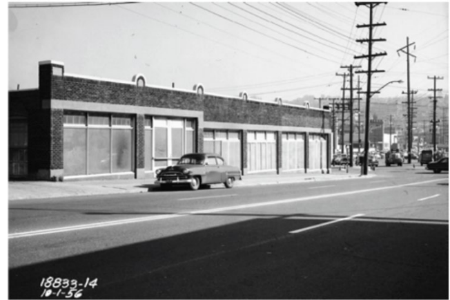
October 1, 1956 photo of the southern side of the property.

The site is located in Seattle’s South Lake Union neighborhood one block from Lake Union. It is made up of four King County parcels. The parcels are located within the historical extents of Lake Union and were filled in as part of regional regrading in the early part of the 1900s. The site was home to a car showroom as well as various car services from the 1920s through 2019. The original structures on the site were demolished in 2021 in preparation for redevelopment. The site currently operates as a parking lot for nearby construction.