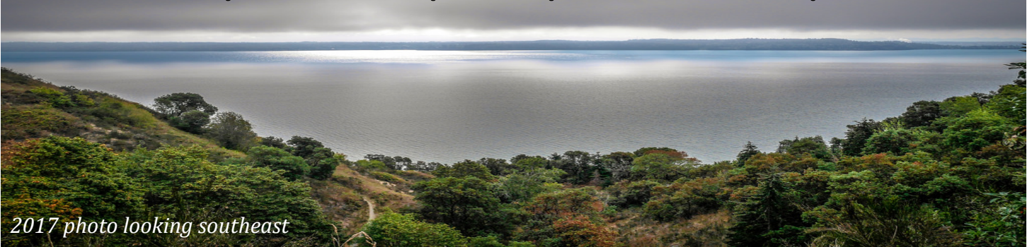
2017 photo looking southeast