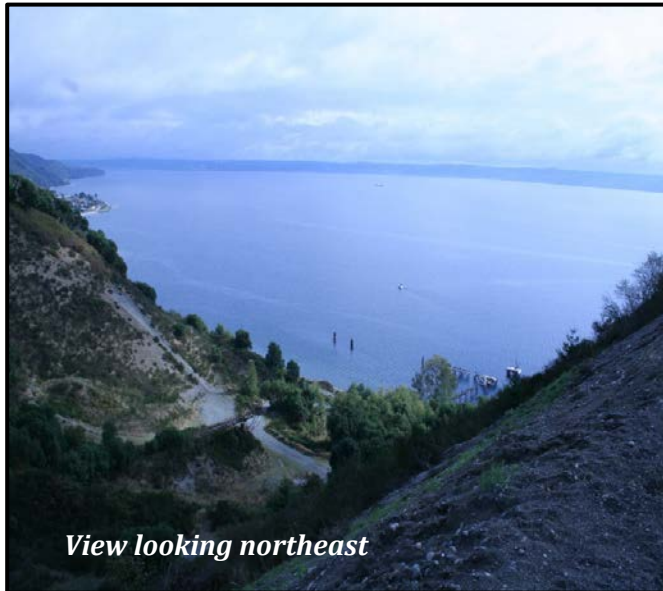
View looking northeast