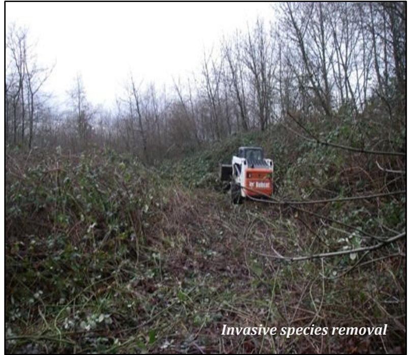
Invasive species removal