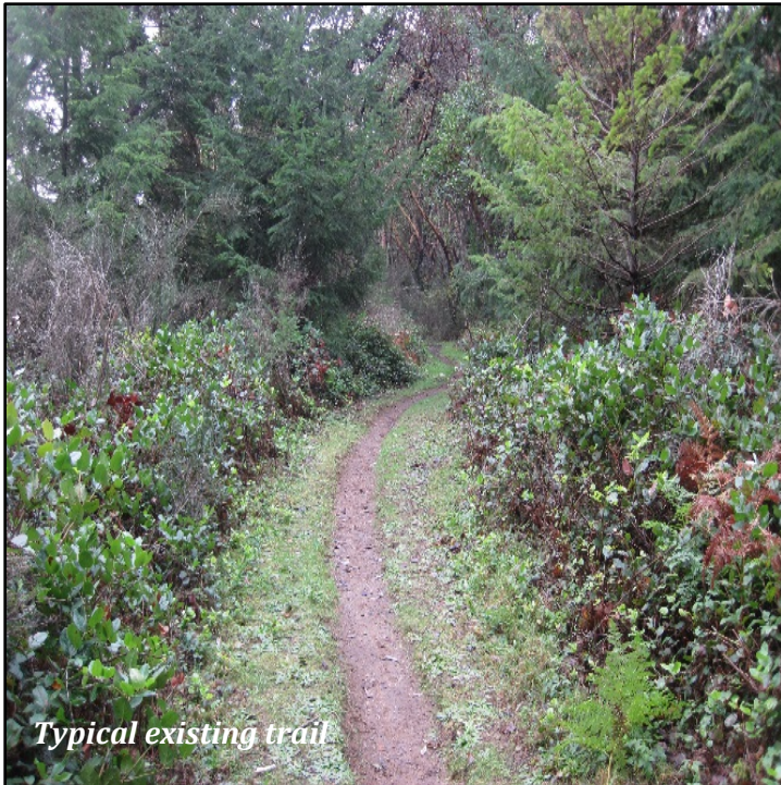
Typical existing trail