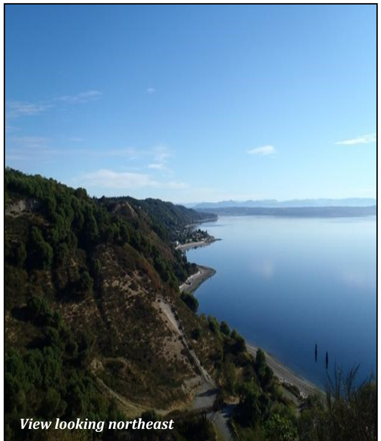
View looking northeast

Design of the cleanup work is expected to be done in 2018, and construction beginning in 2019. The cost, including operation and maintenance, is estimated to be about $5.5 million.