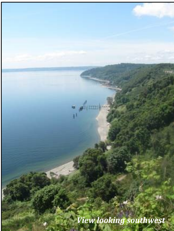
View looking southwest