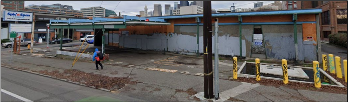
Spic N Span Cleaners site location