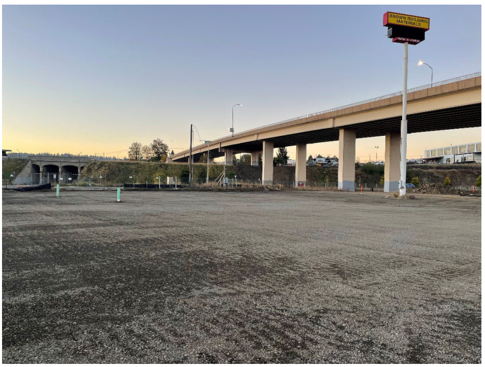
Photograph 2 . View of proposed Building 2A footprint with building footprint excavation backfilled and stormwater cover placed and compacted. Looking southwest.