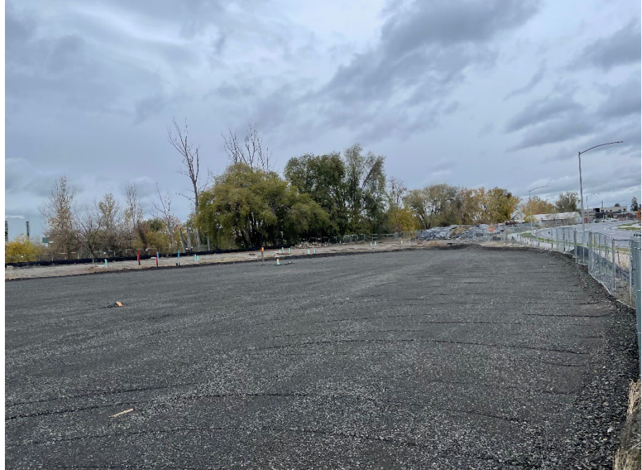
Photograph 1. View of proposed Building 2A footprint with building footprint excavation backfilled and stormwater cover placed and compacted. Looking northeast.