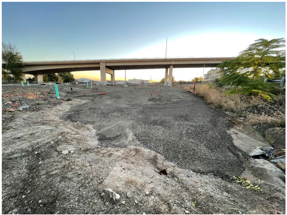
Photograph 4. View of proposed Building 2B footprint with building footprint excavation backfilled and stormwater cover placed and compacted. Looking east.