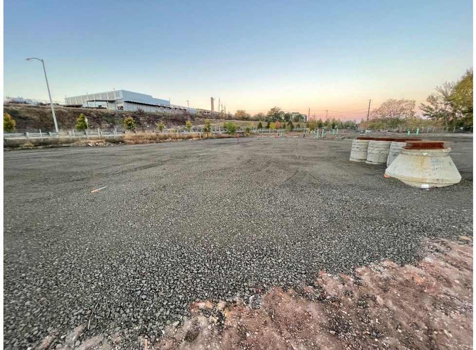
Photograph 3. View of proposed Building 2B footprint with building footprint excavation backfilled and stormwater cover placed and compacted. Looking west.