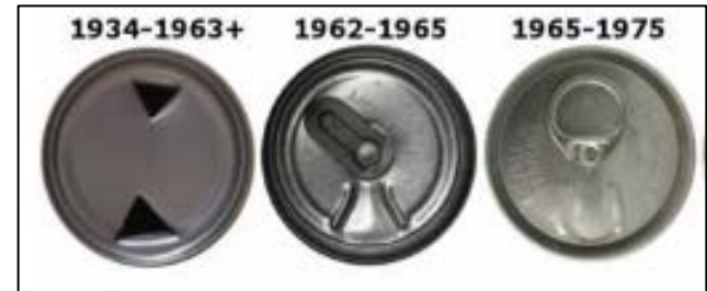
Can opening dates, courtesy of W.M. Schroeder.