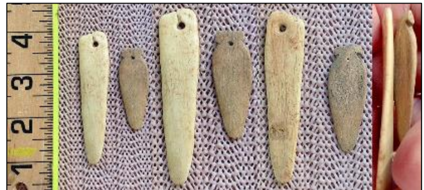
Above: Tooth Pendants. Right: Bone Pendants. Both from Oregon and Washington.