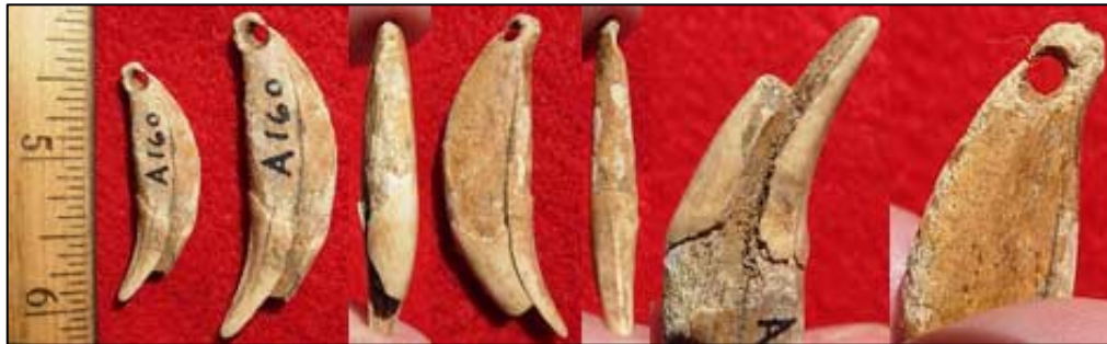
Upper Left: Bone Awls from Oregon.