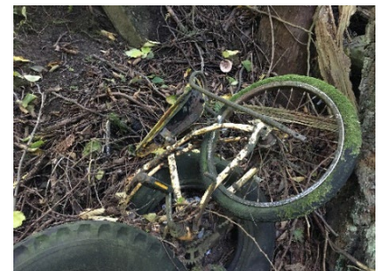
Uncovered landfill debris

In August 2019, community members sent a letter to SCPH with questions about a proposed addition of a bike skills park to the capped area of the former landfill. Ecology received a copy of this letter and re-evaluated the available Site information in November 2019. Ecology concluded that additional sampling was needed to fully characterize the Site.