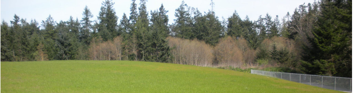
A Avenue Landfill next to gravel road (2010)