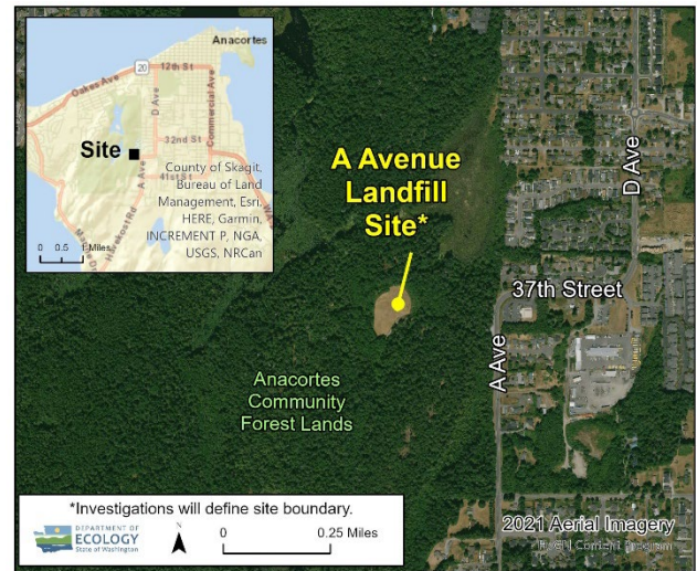
Aerial view of A Avenue Landfill Site

The City has worked with SCPH and Ecology since 2003 to properly close the former landfill and perform routine post-closure monitoring and maintenance.