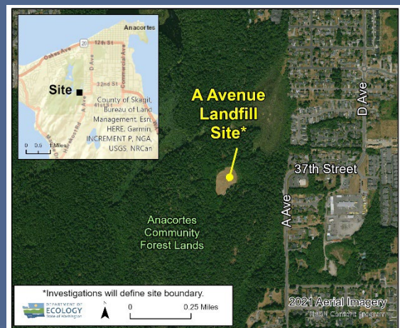
Aerial map of A Avenue Landfill site

ian.fawley@ecy.wa.gov , or visit ecology.wa.gov/Accessibility . For Relay Service or TTY call 711 or 877-833-6341.