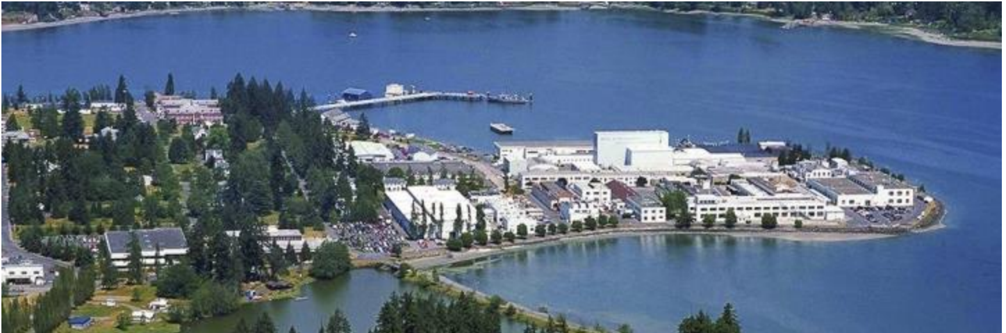
Figure 1: View of the United States naval base in Keyport, Washington.

Comments accepted: April 8 – June 14, 2024