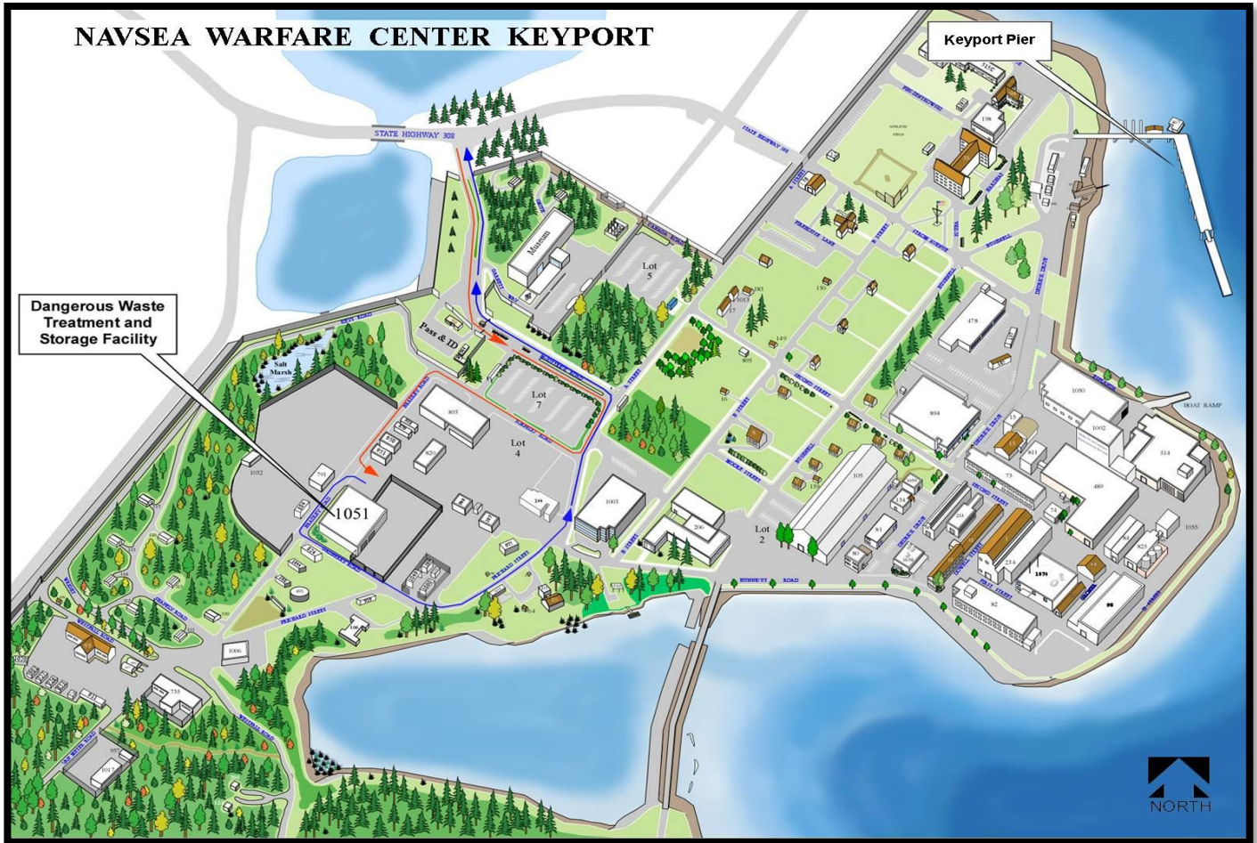
Figure 2: NUWC Keyport site map showing the location of the dangerous waste storage facility (building 1051).

Officially, a permitted dangerous waste storage facility it is known as a dangerous waste treatment, storage, and disposal (TSD) facility. We usually refer to it as a “facility.” The NUWC Keyport facility is also known as “building 1051.”