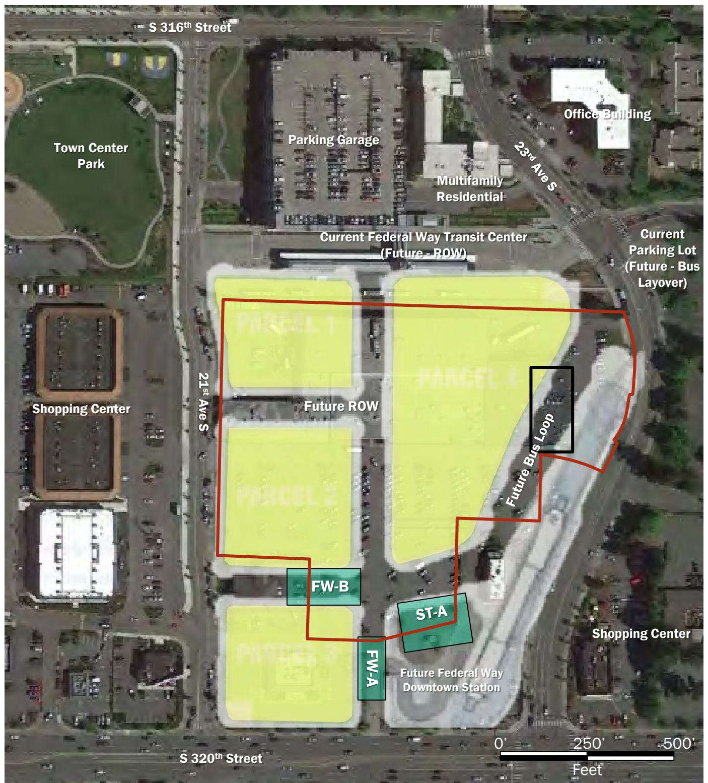
Figure 1 Site Plan