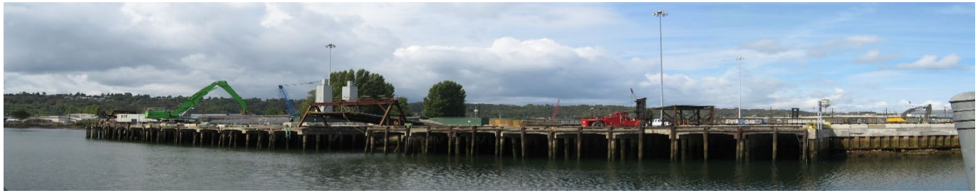
Figure 2: Crowley Marine viewed from the southwest