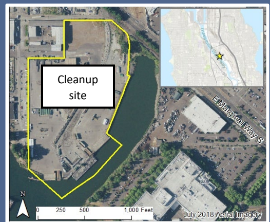
Aerial map of the Crowley Marine cleanup site.

To request an ADA accommodation, contact Ecology by phone at 425-533-5537 or email LDW@ecy.wa.gov , or visit ecology.wa.gov/Accessibility . For Relay Service or TTY call 711 or 877-833-6341.