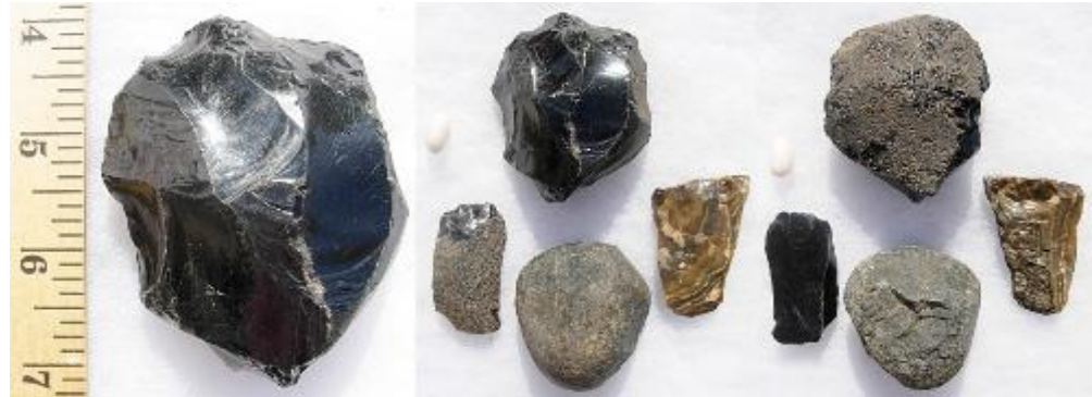
Stone artifacts from Oregon.