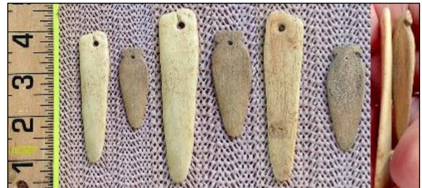
Upper Left: Bone Awls from Oregon.