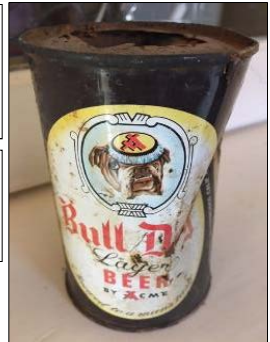
Right: Old beer can found in Oregon. ACME was owned by Olympia Brewery.