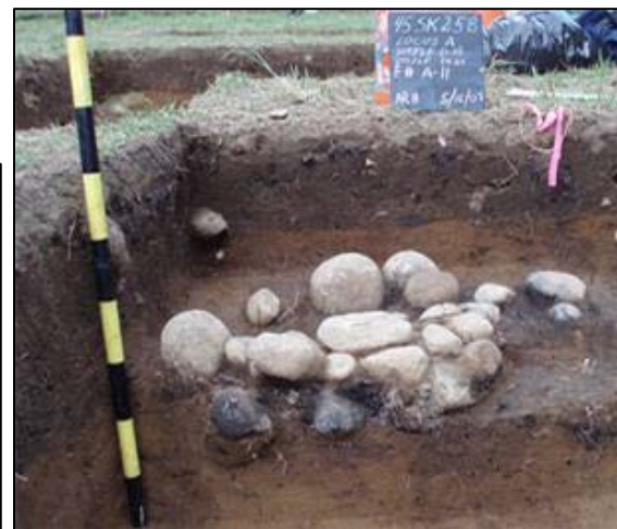
Hearth excavated near Hamilton, WA.