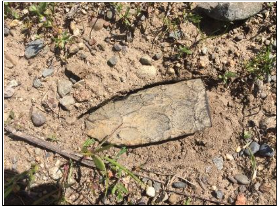
Biface-knife, scraper, or pre-form found in NE Washington. Thought to be a well knapped object of great antiquity.