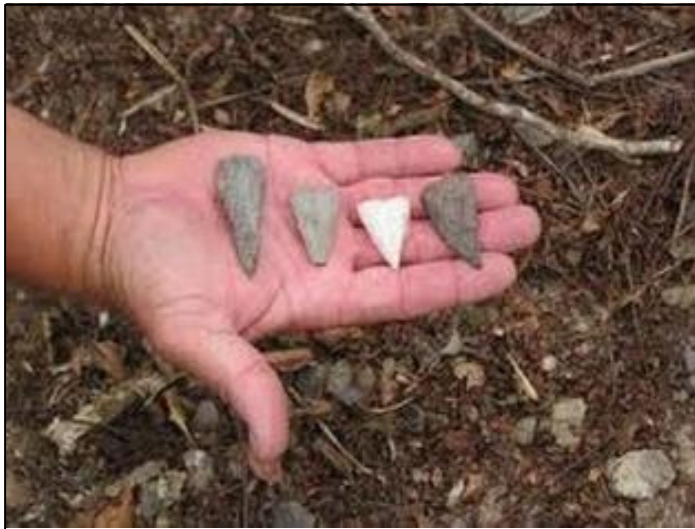
Stone artifacts from Washington.