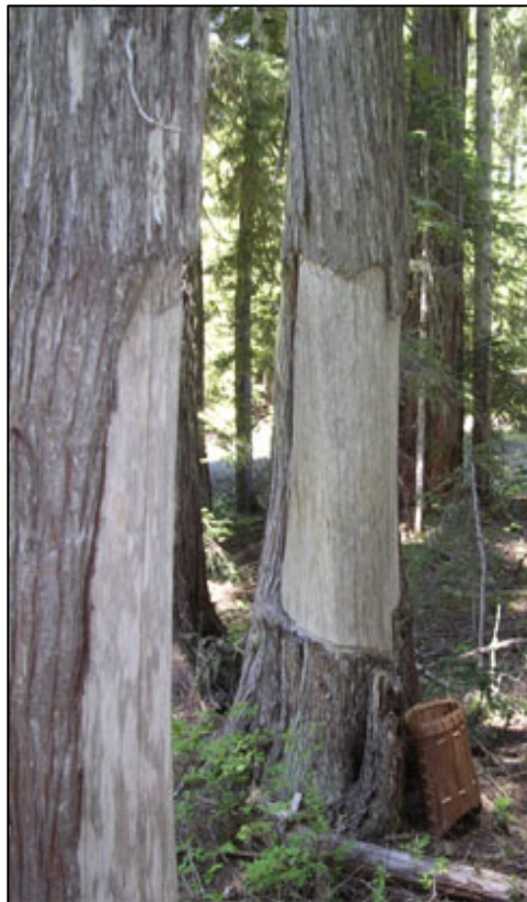
Left and Below: Culturally modified tree and an old carving on an aspen.