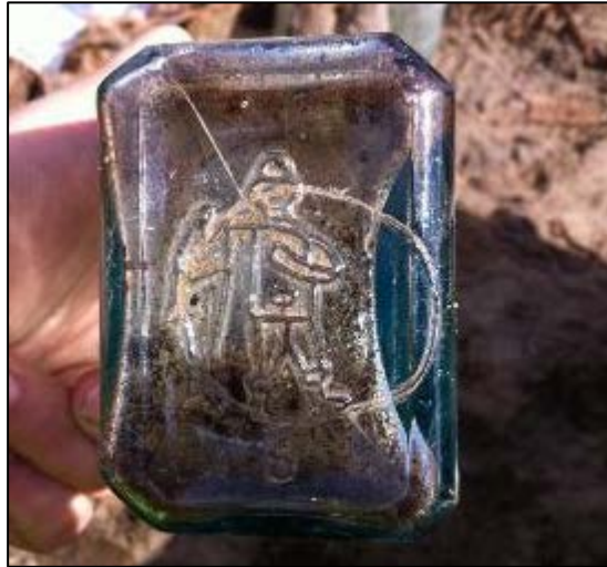
Far Left: .303 British cartridge found by a WCC planting crew on Skagit River. Don't ever touch something like this! Left: Maker's mark on bottom of old bottle.