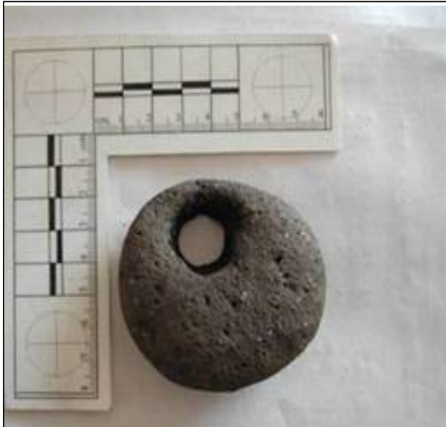
Artifacts from unknown locations (left and right images).