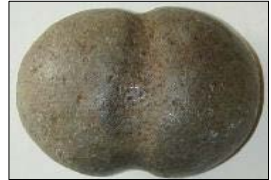
Above: Fishing Weight - credit CRITFC Treaty Fishing Rights website .