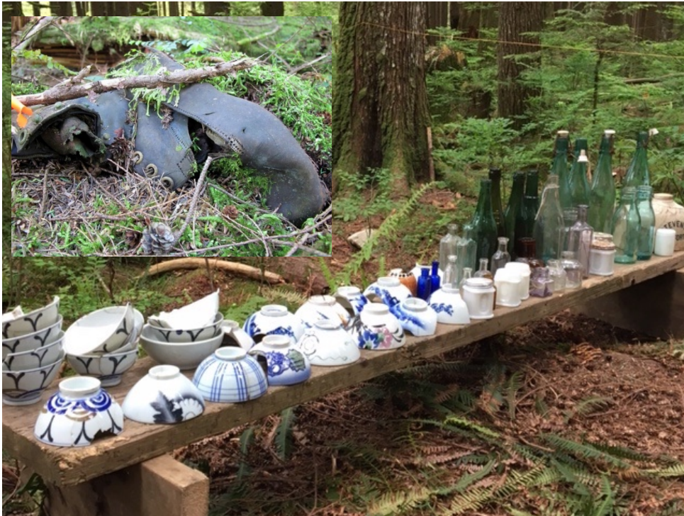
Main Image: Dishes, bottles, workboot found at the North Shore Japanese bath house (ofuro) site, Courtesy Bob Muckle, Archaeologist, Capilano University, B.C. This is an example of an above ground resource.