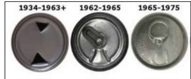
Can opening dates, courtesy of W.M. Schroeder.