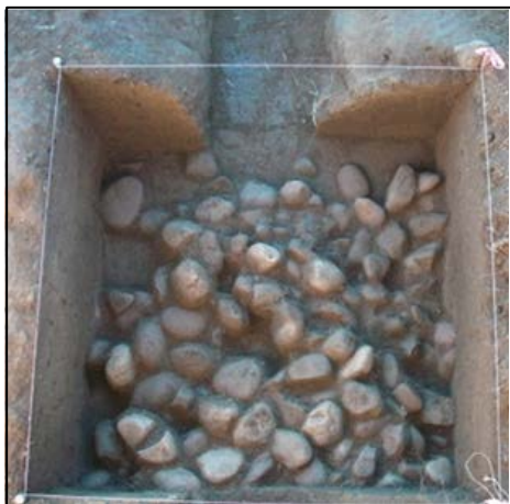
Underground oven.