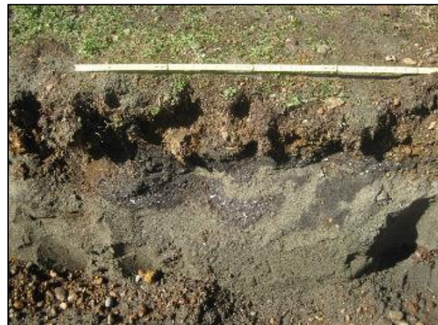
Shell Midden pocket in modern fill discovered in sewer trench.