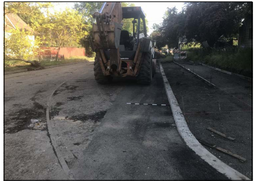
Counter Clockwise, Left to Right: Historic structure 45KI924, in WSDOT right of way for SR99 tunnel. Remnants of Smith Cove shantytown (45-KI-1200) discovered during Ecology CSO excavation, City of Spokane historic trolley tracks uncovered during stormwater project, intact foundation of historic home that survived the Great Ellensburg Fire of July 4, 1889, uncovered beneath parking lot in Ellensburg.