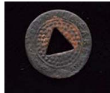
Right, from Top to Bottom: Coins, token, spectacles and Montgomery Ward pitchfork toy discovered during Seattle Smith Cove shantytown (45-KI-1200) excavation.