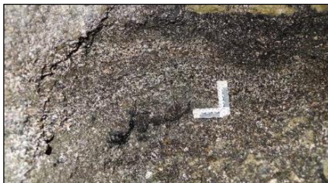
Shell midden with fire cracked rock.