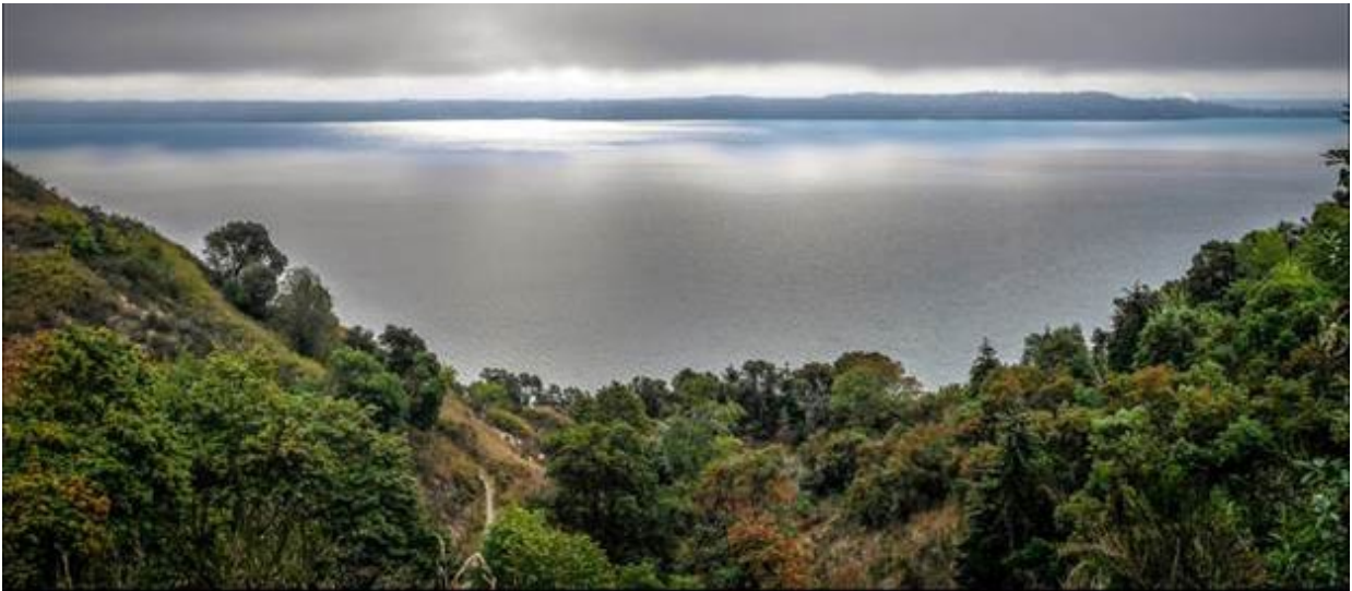
View from Maury Island Open Space looking southeast, 2017

Legal agreement amendment ready for public review