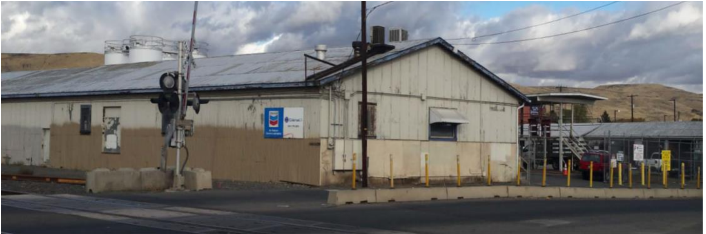
Coleman Oil Yakima Bulk Plant