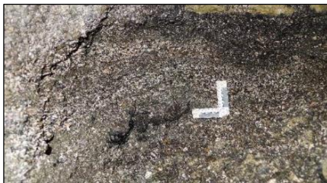
Shell midden with fire cracked rock.