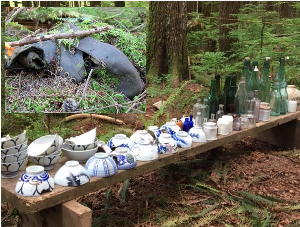
Main Image: Dishes, bottles, workboot found at the North Shore Japanese bath house (ofuro) site, Courtesy Bob Muckle, Archaeologist, Capilano University, B.C. This is an example of an above ground resource.