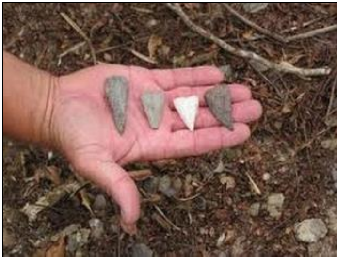
Stone artifacts from Washington.