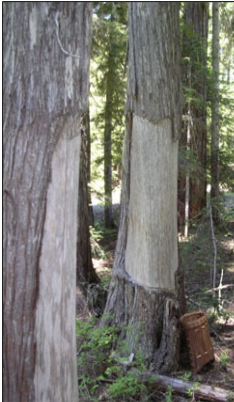
Left and Below: Culturally modified tree and an old carving on an aspen.