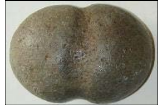
Above: Fishing Weight.