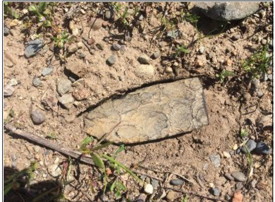
Biface-knife, scraper, or pre-form found in NE Washington. Thought to be a well knapped object of great antiquity. Courtesy of Methow Salmon Rec. Foundation.