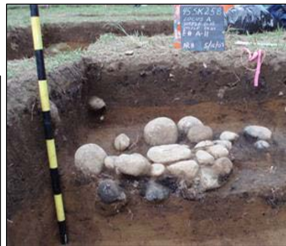
Hearth excavated near Hamilton, WA.