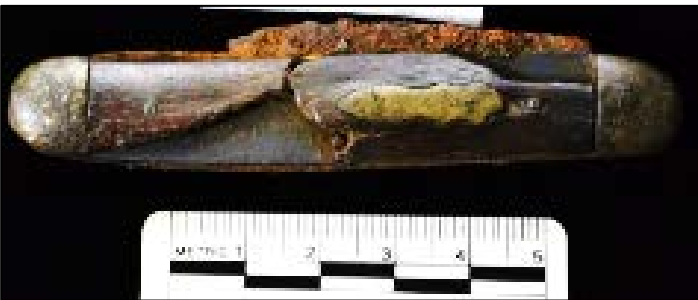
Right: Collections of historic artifacts discovered during excavations in eastern Washington cities.