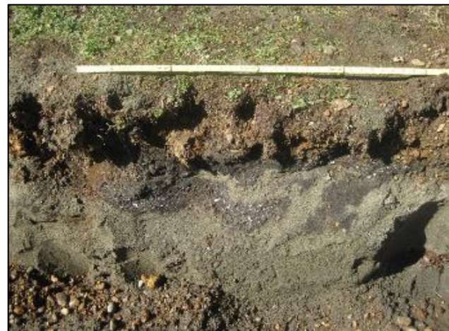
Shell Midden pocket in modern fill discovered in sewer trench.