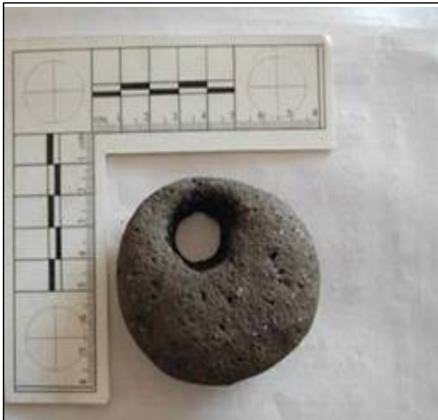
Artifacts from unknown locations (left and right images).