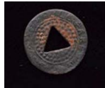
Right, from Top to Bottom: Coins, token, spectacles and Montgomery Ward pitchfork toy discovered during Seattle Smith Cove shantytown (45-KI-1200) excavation.