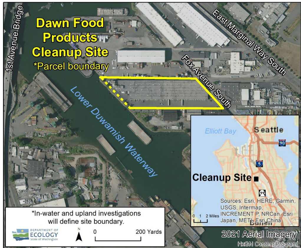
Figure 4: Aerial view of Dawn Food Products Parcel