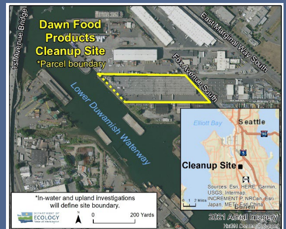
Aerial map of the Dawn Food Products cleanup site

LDW@ecy.wa.gov , or visit ecology.wa.gov/Accessibility . For Relay Service or TTY call 711 or 877-833-6341.