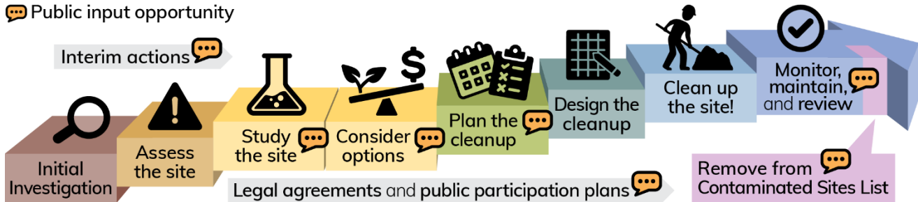
Figure 2: Washington’s formal cleanup process

The Model Toxics Control Act ( MTCA 1 ) is Washington’s environmental cleanup law. It provides requirements for contaminated site cleanup and sets standards that protect human health and the environment. Ecology implements the MTCA cleanup process 2 and oversees cleanups.