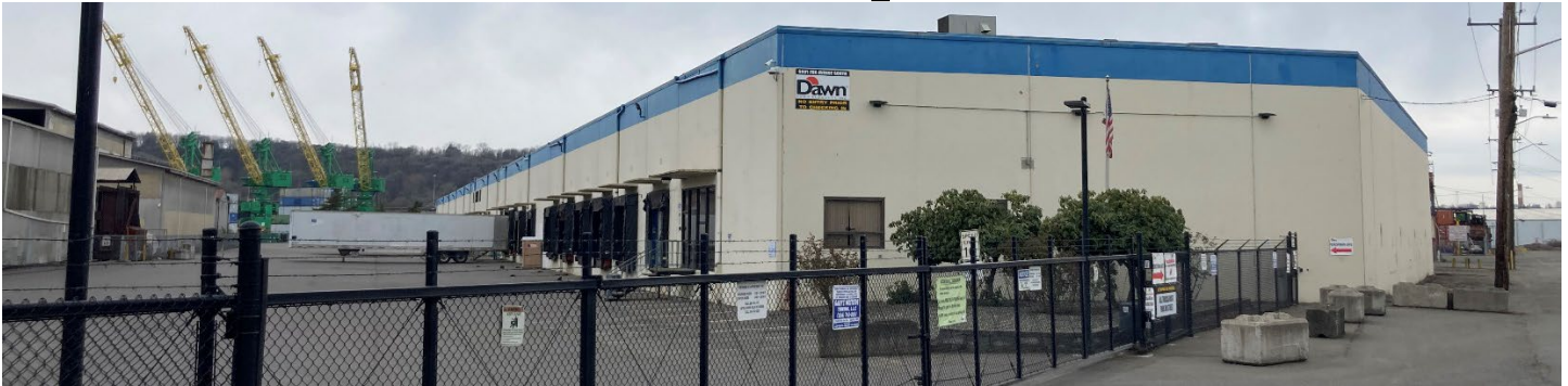
Dawn Food Products Main Building