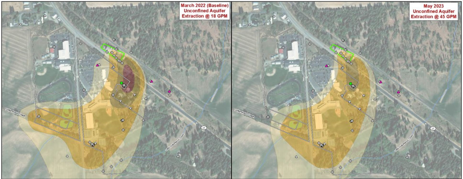
Figure 4. The plume of carbon tetrachloride in groundwater is shown in yellow and red in March 2022 and May 2023. The lack of red and reduction in other darker colors in May 2023 show significant contaminant reduction, which is continuing to occur.

In March, 18 gallons of groundwater per minute were being removed, with a planned slow increase to 45 gallons per minute in May. The increased pumping rate helped to remove more contamination without impacting residential well capacity. This is one of the factors we are monitoring to optimize the system.