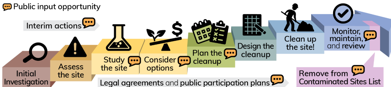
Figure 3. The Grain Handling Facility at Freeman site is in the “Consider options” step, using an “Interim action” to optimize the treatment system. After the system is optimized, we can “Plan the cleanup” by proposing our final decision in a draft Cleanup Action Plan that will be available for public input.