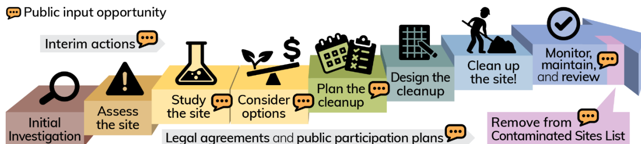
Figure 1: Washington's formal cleanup process ( see a plain text description 21 ).

See the graphic below and visit Ecology's cleanup process webpage 20 to learn more about Washington's formal cleanup process.