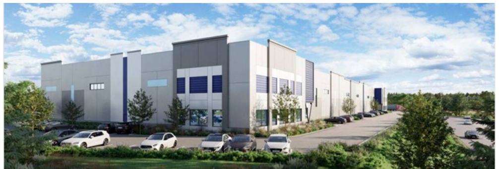
A rendering of the 180,000-square-foot warehouse Bridge Industrial plans to build at 7730 S. 202nd St. in Kent.

The redevelopment will include a new 178,700 square foot warehouse building with a concrete and asphalt loading dock, roads, and parking area. A new stormwater facility and utility connections will be installed. A new wetland will be created within the eastern portion of the property.