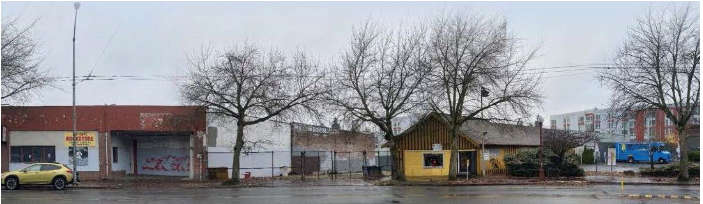
Morningside Acres site location