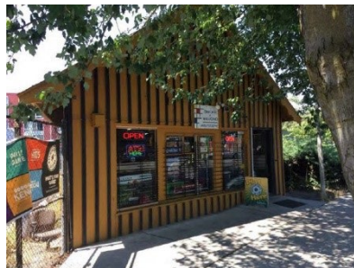
Existing convenience store 5015 Rainier Ave S