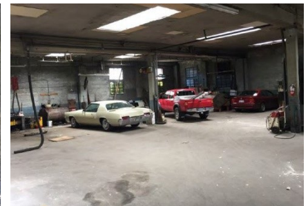
Former auto repair operations 5021 Rainier Ave S

The need for a PPCD at this Site arises from the historical uses at the property. The North (5001 Rainier Ave S), Middle (5015 Rainier Ave S), and South Parcels (5021 Rainier Ave S) of this Site have different histories. The North Parcel was used for at least two generations of gas stations from 1927 to the early 1970s. The Middle Parcel was used as a lumberyard office from approximately 1926 to 1965, an insurance agent office from 1966 to 1980, and a convenience store from 1980 until the present. The South Parcel was used, at different times, by an automotive maintenance and repair facility, automobile and boat dealerships, a plumbing supply business, a pool hall, a fitness center, and a bookstore, which is the current tenant. These prior operations on the Site have resulted in areas of petroleum and chlorinated solvent contamination to soil and groundwater, the extent of which will be determined in the remedial investigation.