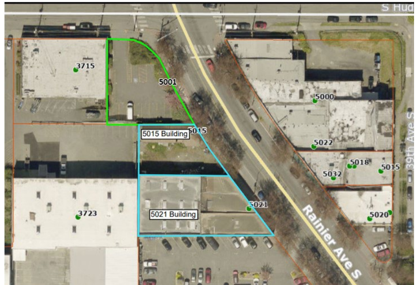
Aerial view of the cleanup Site