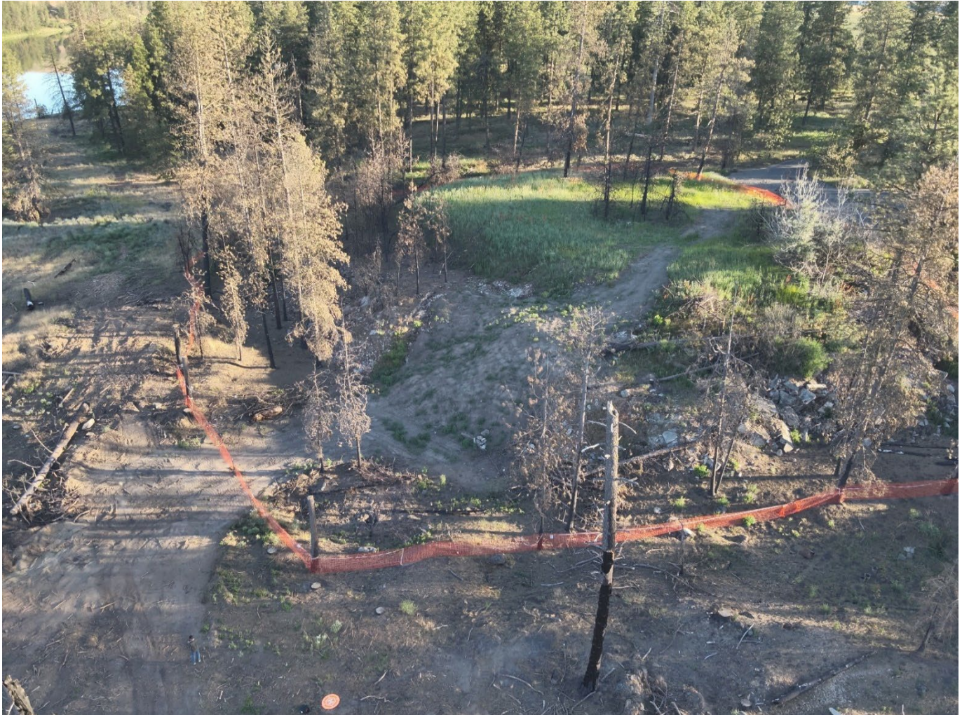
Figure 2. Drone image of the landfill taken in June 2024 while monitoring underground temperatures.